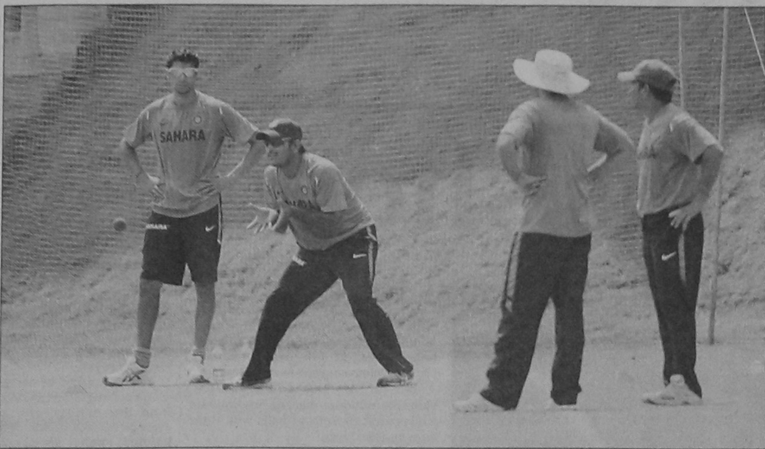
India skipper Mahendra Singh Dhoni (C) attempts to catch a ball as Ashish Nehra (L) looks on during a practice session in Mumbai yesterday.