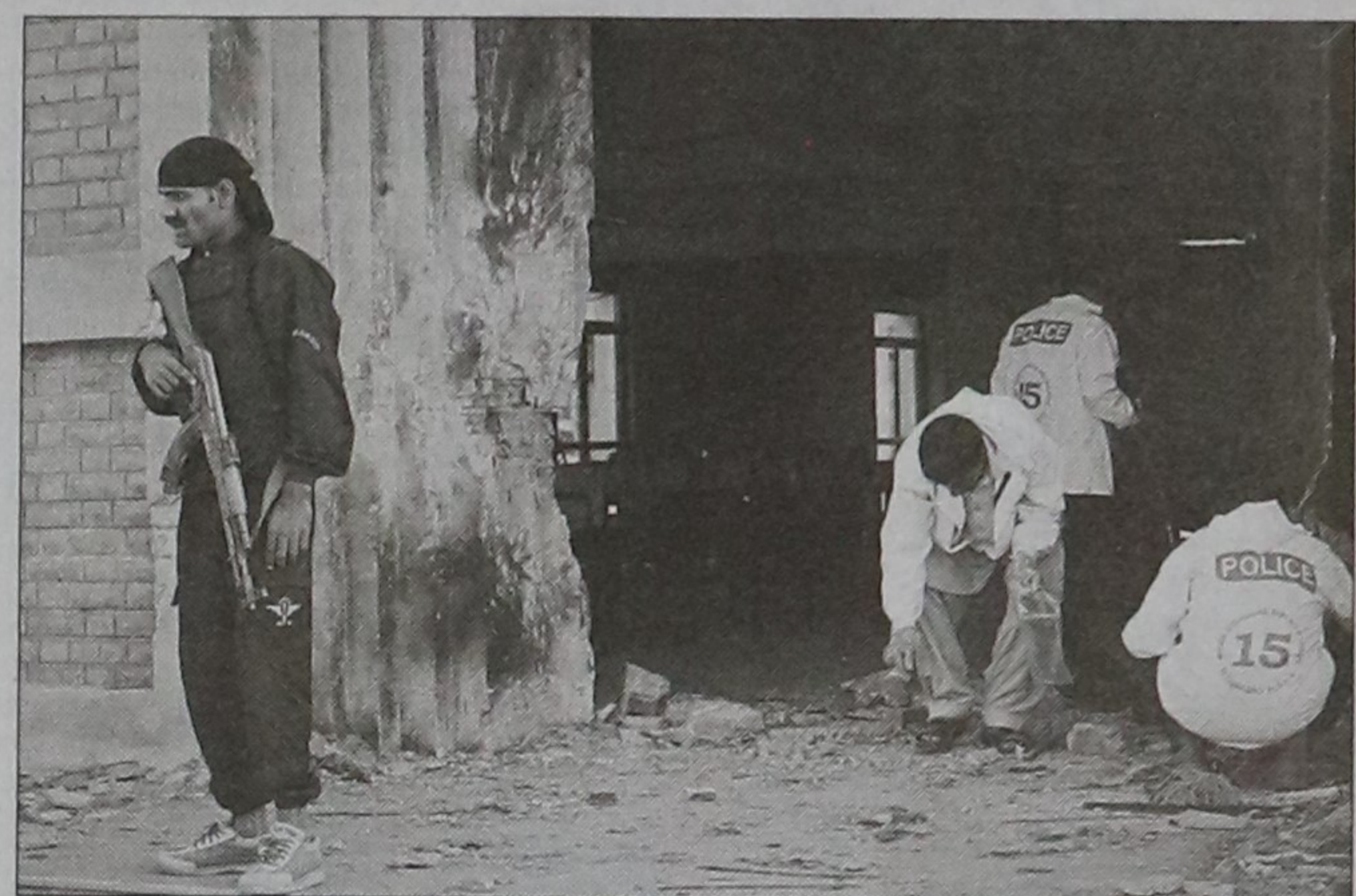
A Pakistani police commando (L) secures an area as police bomb squad officials (R) investigate the scene of a bomb blast at the Islamabad's Islamic International University in Islamabad yesterday. Twin bomb blasts ripped through the university campus here Tuesday, killing at least seven people.

"Having a second round seems to me to be very important, because it's a proof of democracy, and for Afghanistan to take the path of democracy is a good thing," French Foreign Minister Bernard Kouchner said on Tuesday.