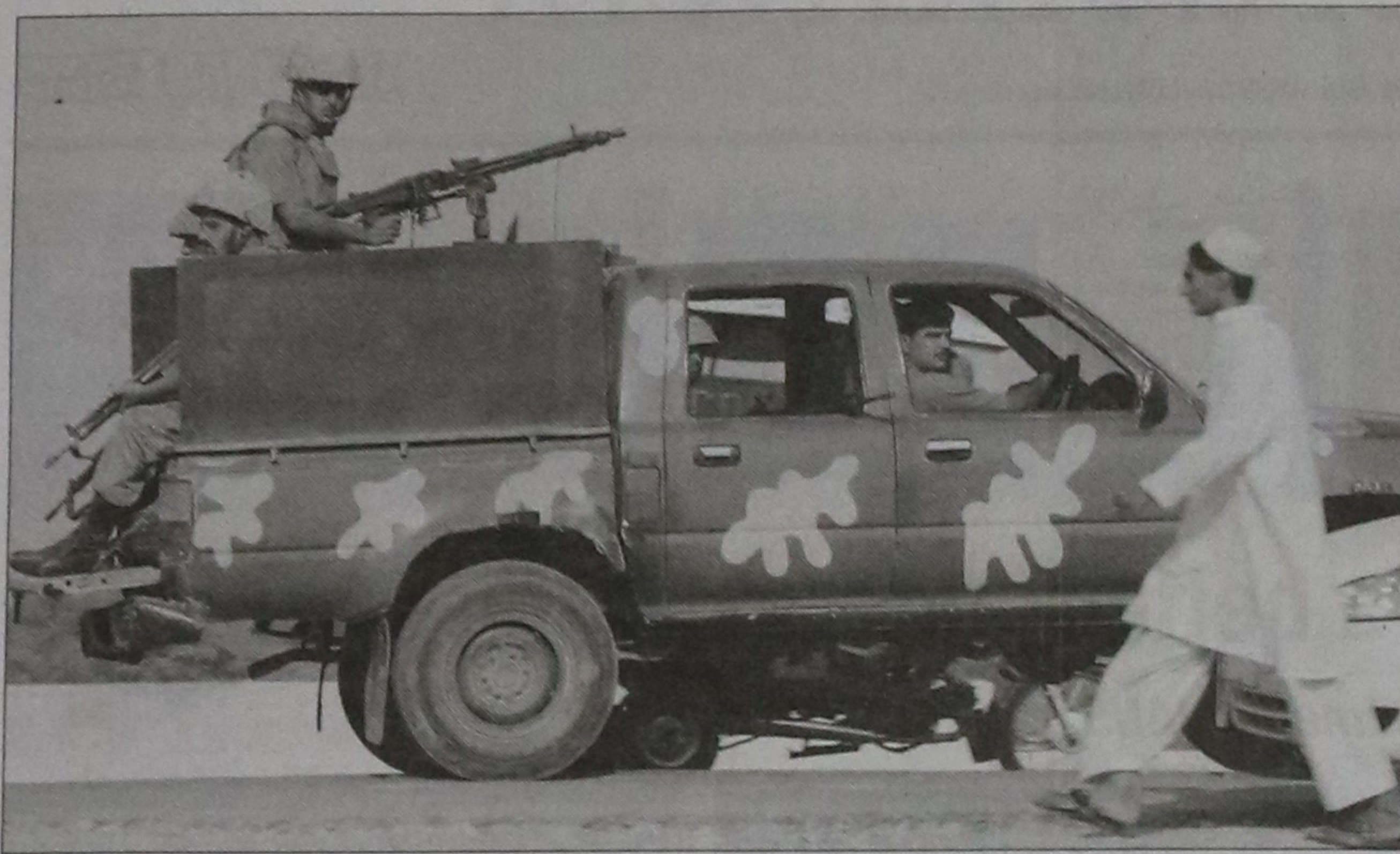
An internally displaced Pakistani civilian, who fled military operations against Taliban militants in South Waziristan, walks past an army vehicle outside a registration office in Dera Ismail Khan yesterday. Pakistani troops and Taliban fighters were locked in fierce clashes on Tuesday in a major offensive that officials said had killed more than 100 people and uprooted 110,000.