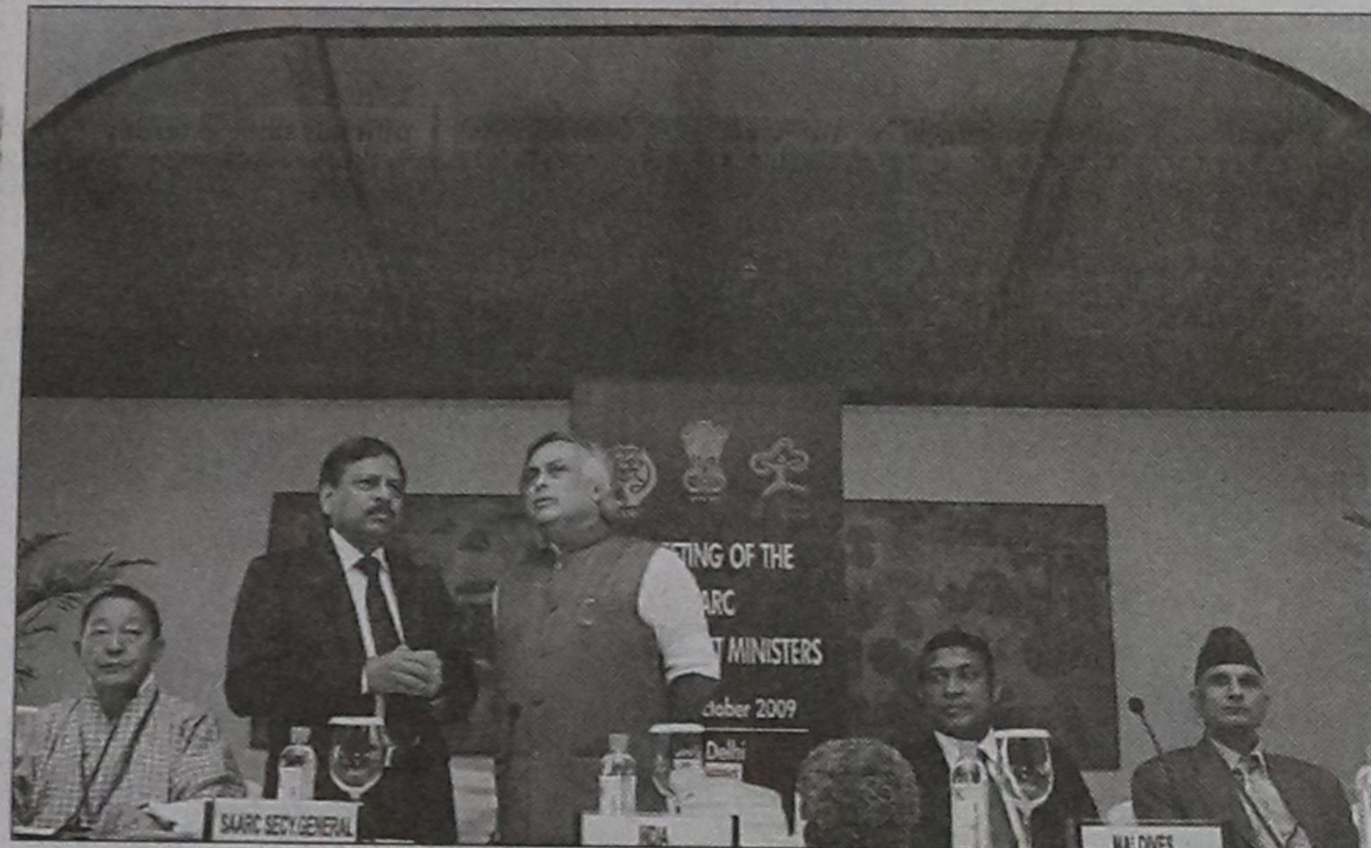
Indian Minister of State for Environment and Forests Jairam Ramesh (C) talks with South Asian Association for Regional Cooperation (Sarc) Secretary General Sheel Kant Sharma (2L) prior to addressing media representatives in New Delhi yesterday after the conclusion of the eighth meeting of Sarc environment ministers.

At the same time, New York-based Human Rights Watch condemned what it described as unacceptable delays in the government's release and resettlement of hundreds of thousands of Tamil civilians displaced in the final months of the island's long-running ethnic conflict.