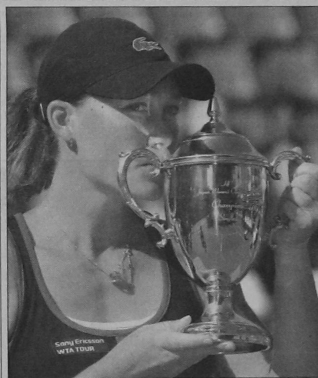
Samantha Stosur of Australia kisses the winner's trophy after defeating Francesca Schiavone of Italy in the Japan Open final in Osaka on Sunday.