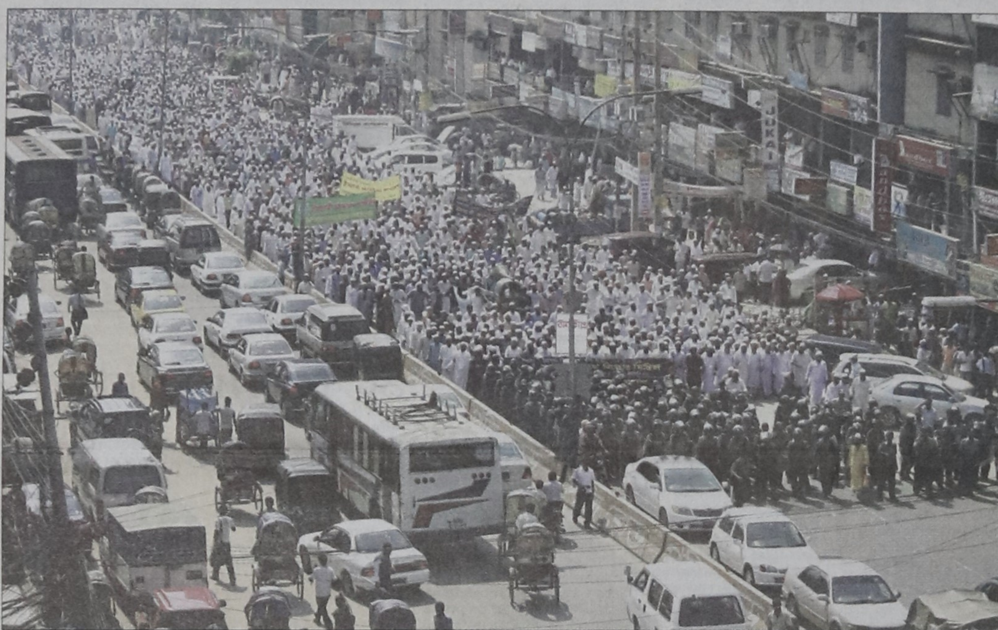
Islami Andolan Bangladesh brings out a procession, heading towards the Indian High Commission, yesterday protesting the proposed Tipaimukh Dam on the Barak in India. The photo was taken near Shanti Nagar Bazar. Story on page 3.