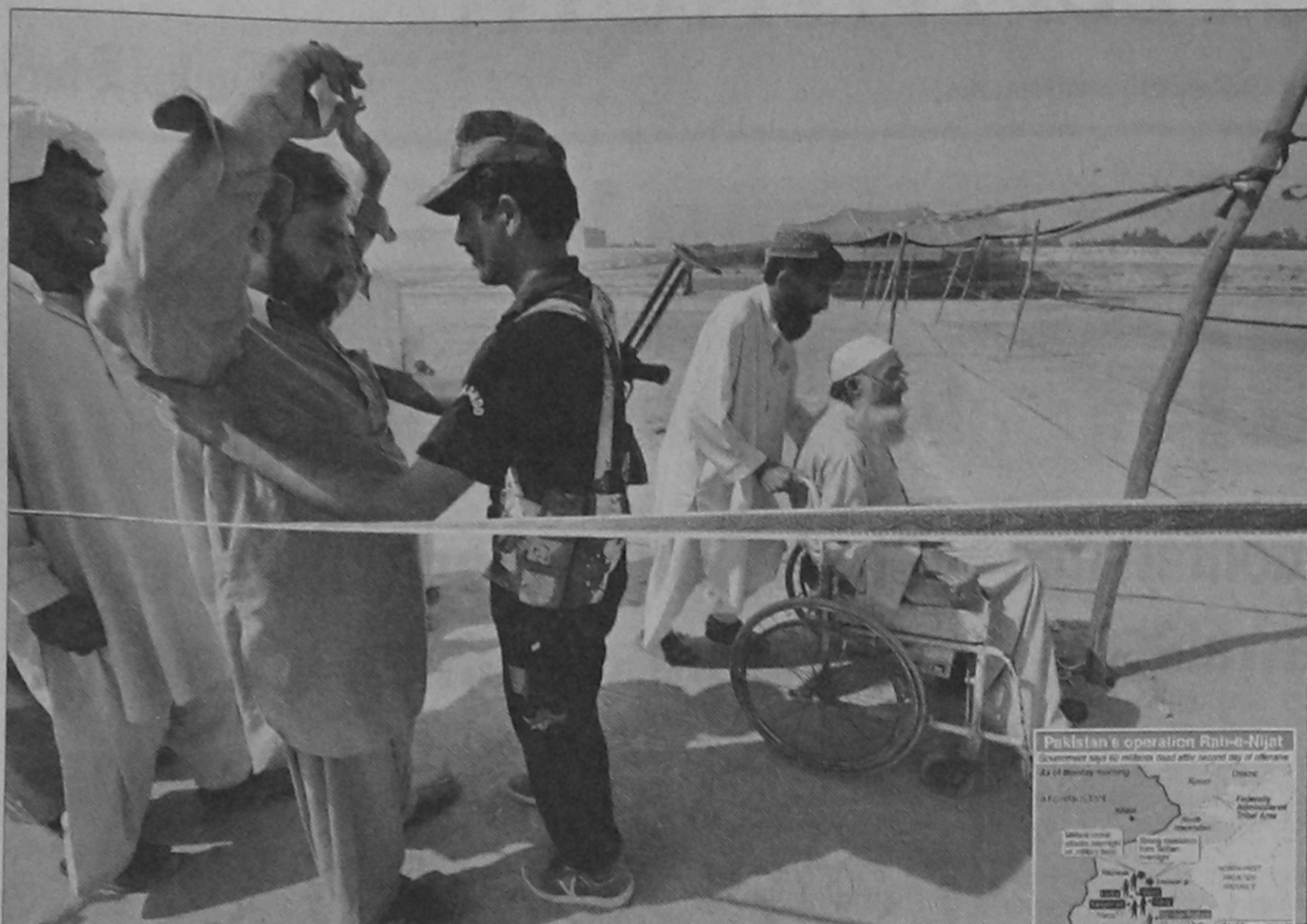
A Pakistani policeman (C) searches internally displaced Pakistani civilians, fleeing military operations against Taliban militants in South Waziristan, in a queue outside a registration office in Dera Ismail Khan yesterday.