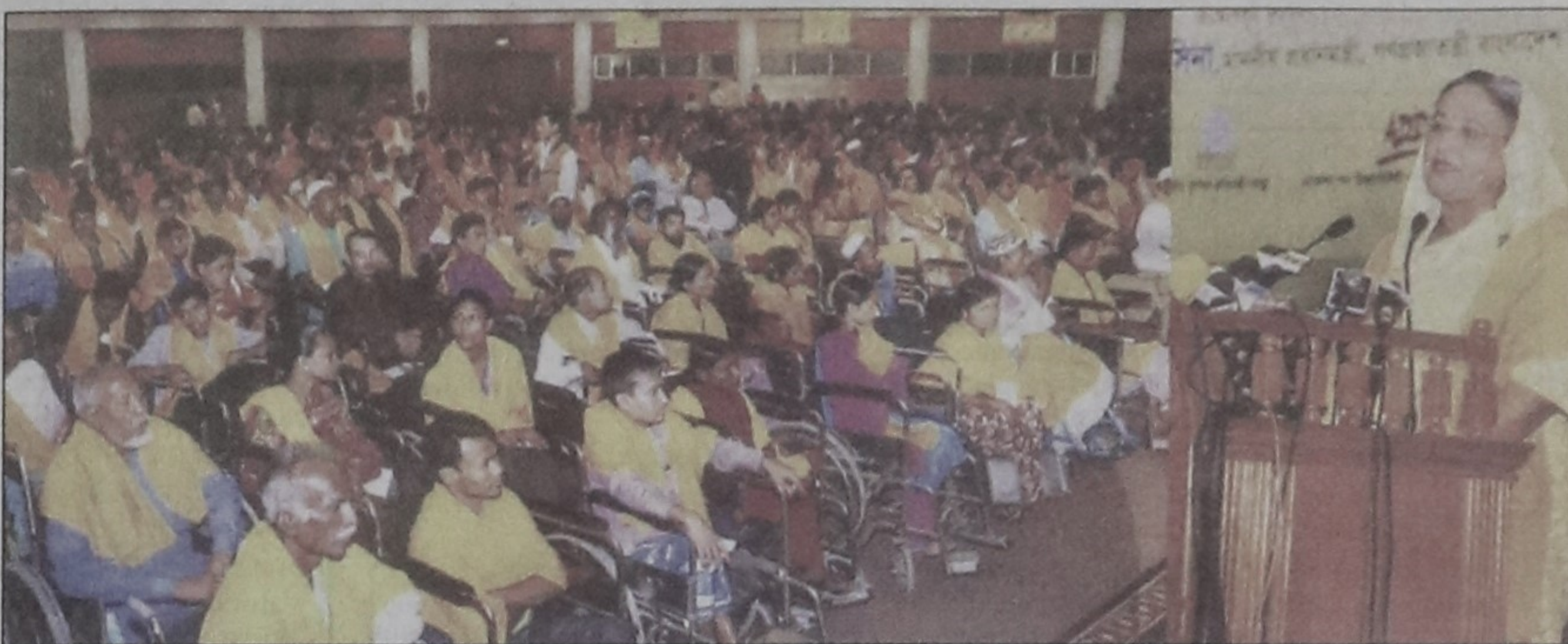
Prime Minister Sheikh Hasina speaks at the 5th National Convention of the Disabled at Bangabandhu International Conference Centre in the city yesterday.

ADD Country Director Mosharraf Hossain said social movement is needed to ensure the rights of the people with disabilities.