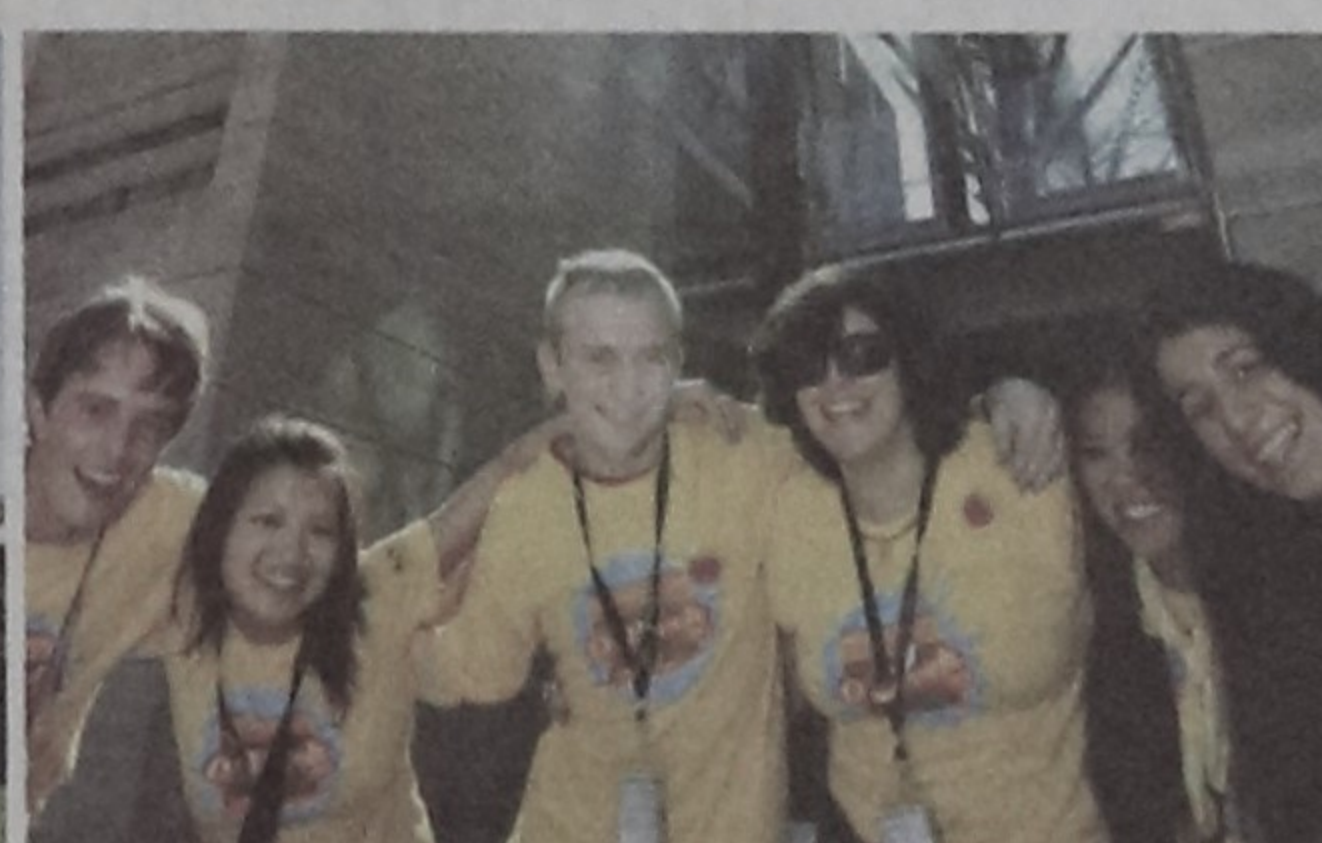
Orientation Week at UNSW