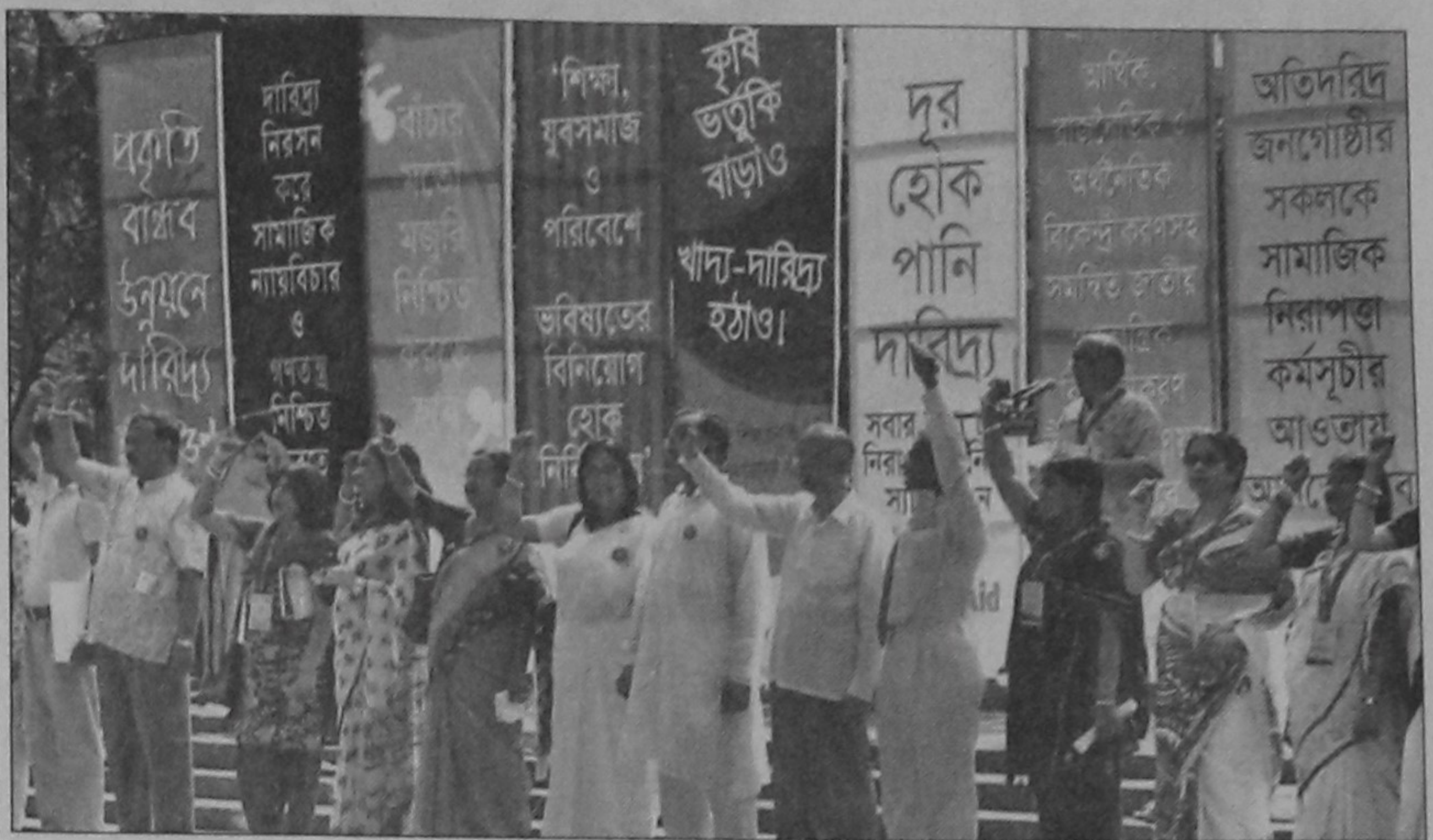
A cross-section of people take a vow to work together to fight poverty and hungry at a programme organised by an anti-poverty platform of 16 citizens' organisations at the Central Shaheed Minar in the city yesterday. (Story on Page 3)

Amin said the minimum wage of workers is only Tk 1,662 in the country now while the World Bank says that those earning Tk 4,200 a month are living below the poverty line.