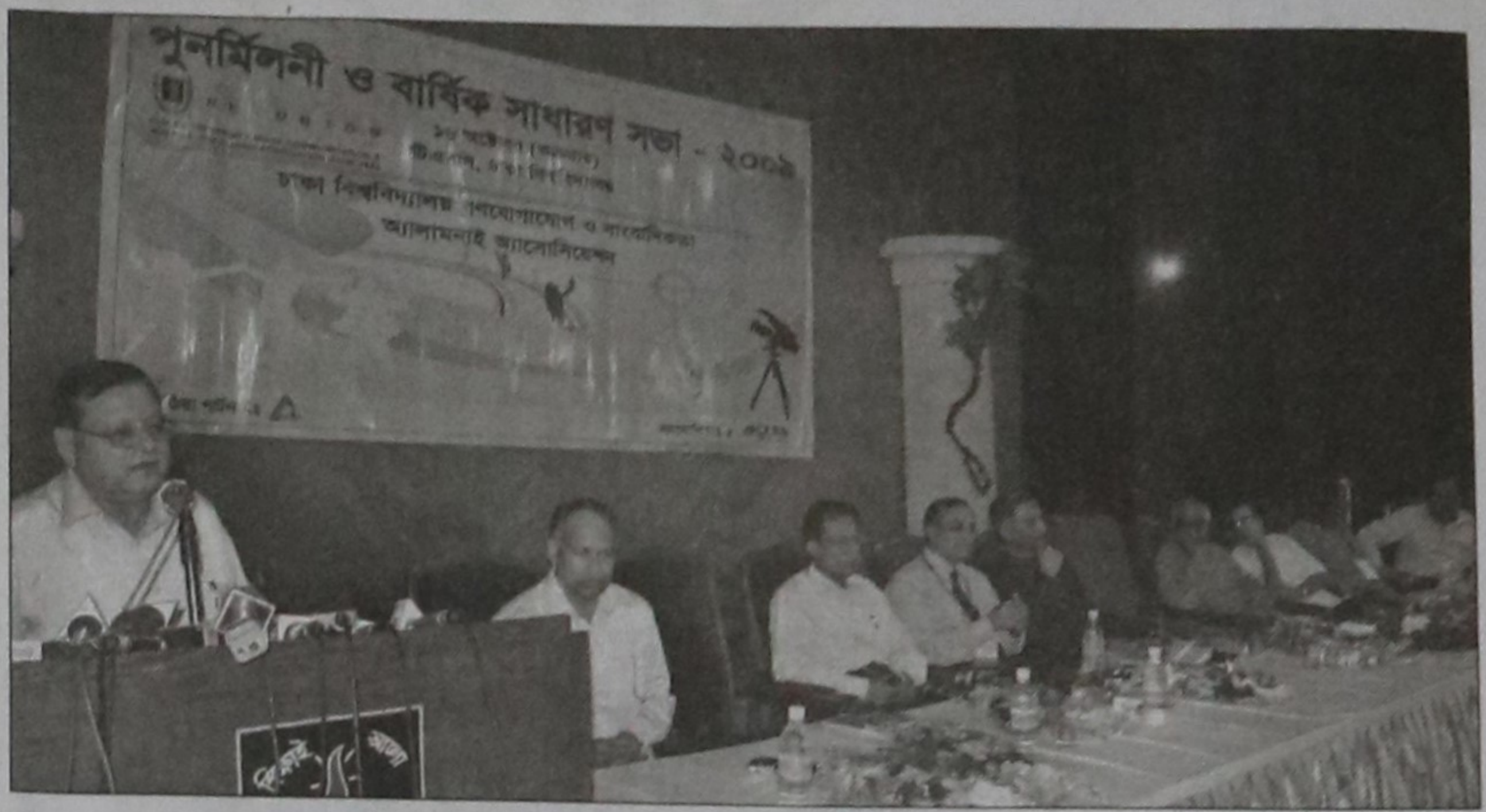
Law Minister Shafique Ahmed speaks at a discussion organised by Dhaka University Mass Communication and Journalism Alumni Association at Teacher-Student Centre yesterday. (Story on Page 5)

Barisal-based 19 correspondents of different print and electronic media attended the programme.