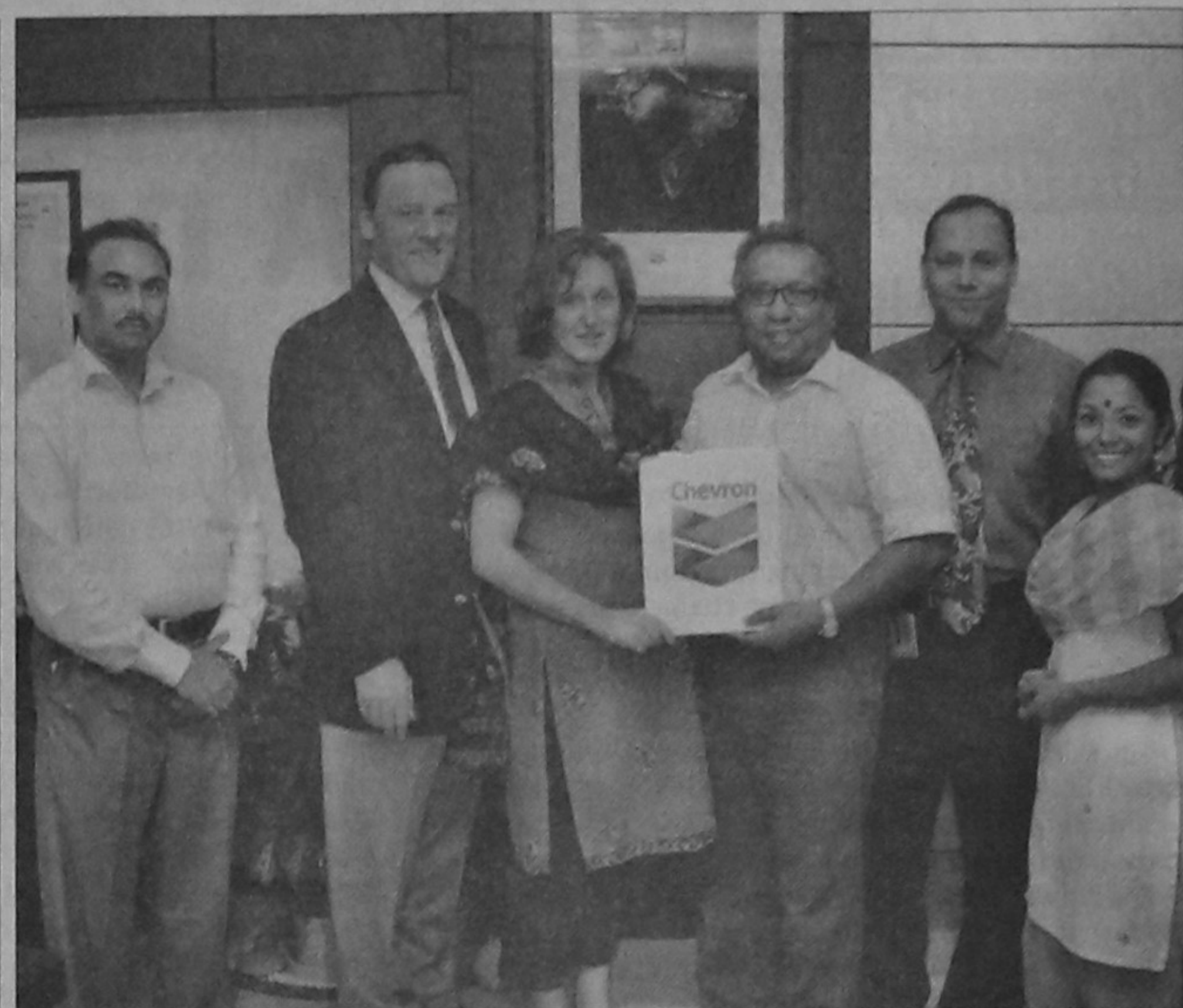
Chevron Bangladesh and Hathay Bunano have signed a partnership to establish a training centre -- "Hathay Bunano Proshikkhan Society" -- to help promote sustainable employment for underprivileged women of Komolganj in Moulvibazar. Chevron will bear 65 percent and Hathay Bunano 35 percent of the Tk 21.22 lakh project.