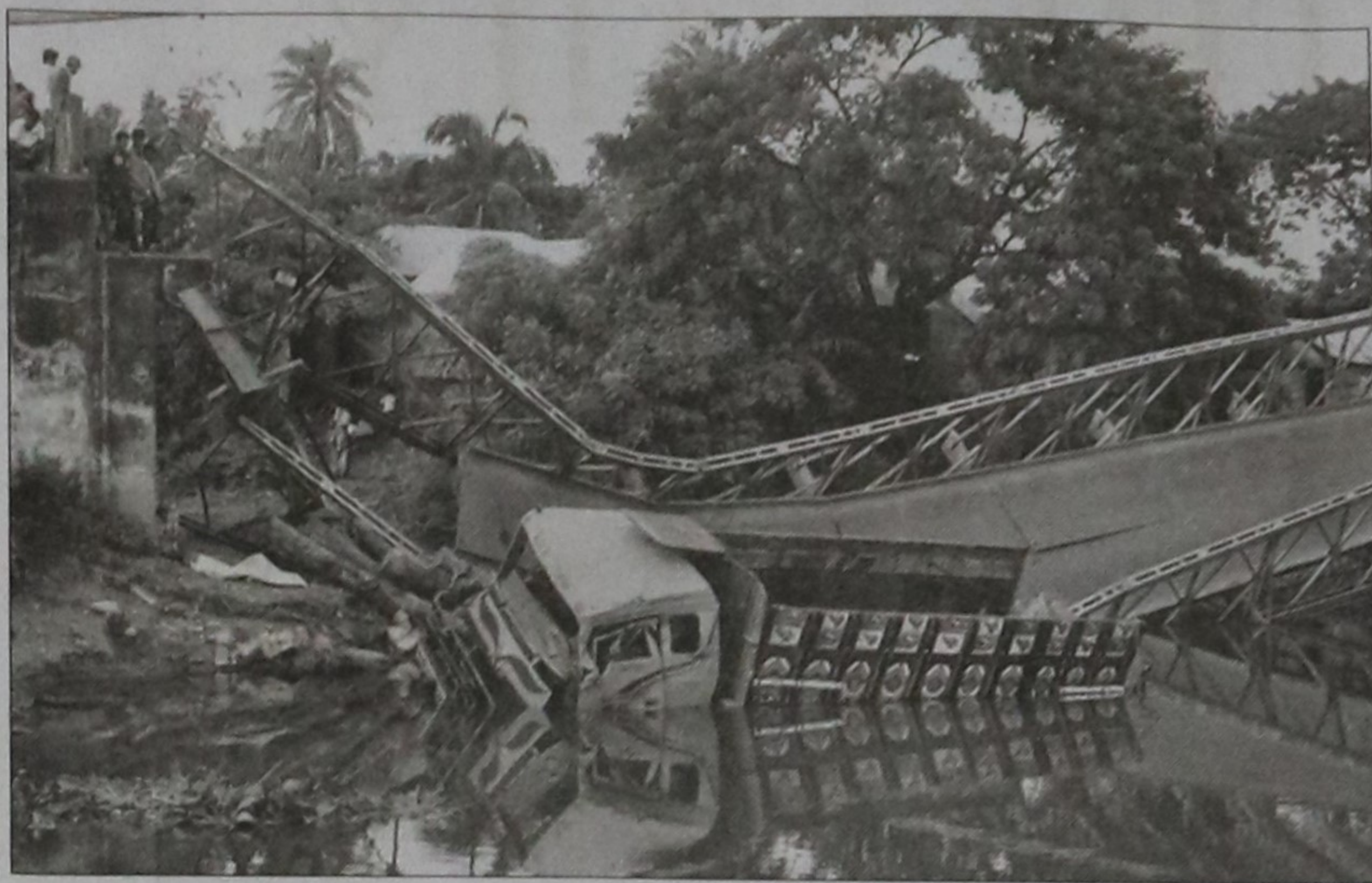
A goods-laden truck falls into a water body as the steel-made bailey bridge in Bhumi area on Singair-Gabtol road in Manikganj collapsed under the weight of the truck yesterday. However, there was no report of casualties.

Bangladesh was made the member to the electoral group-4. The other members of the group include China, Vietnam, Japan, India and Kazakhstan.