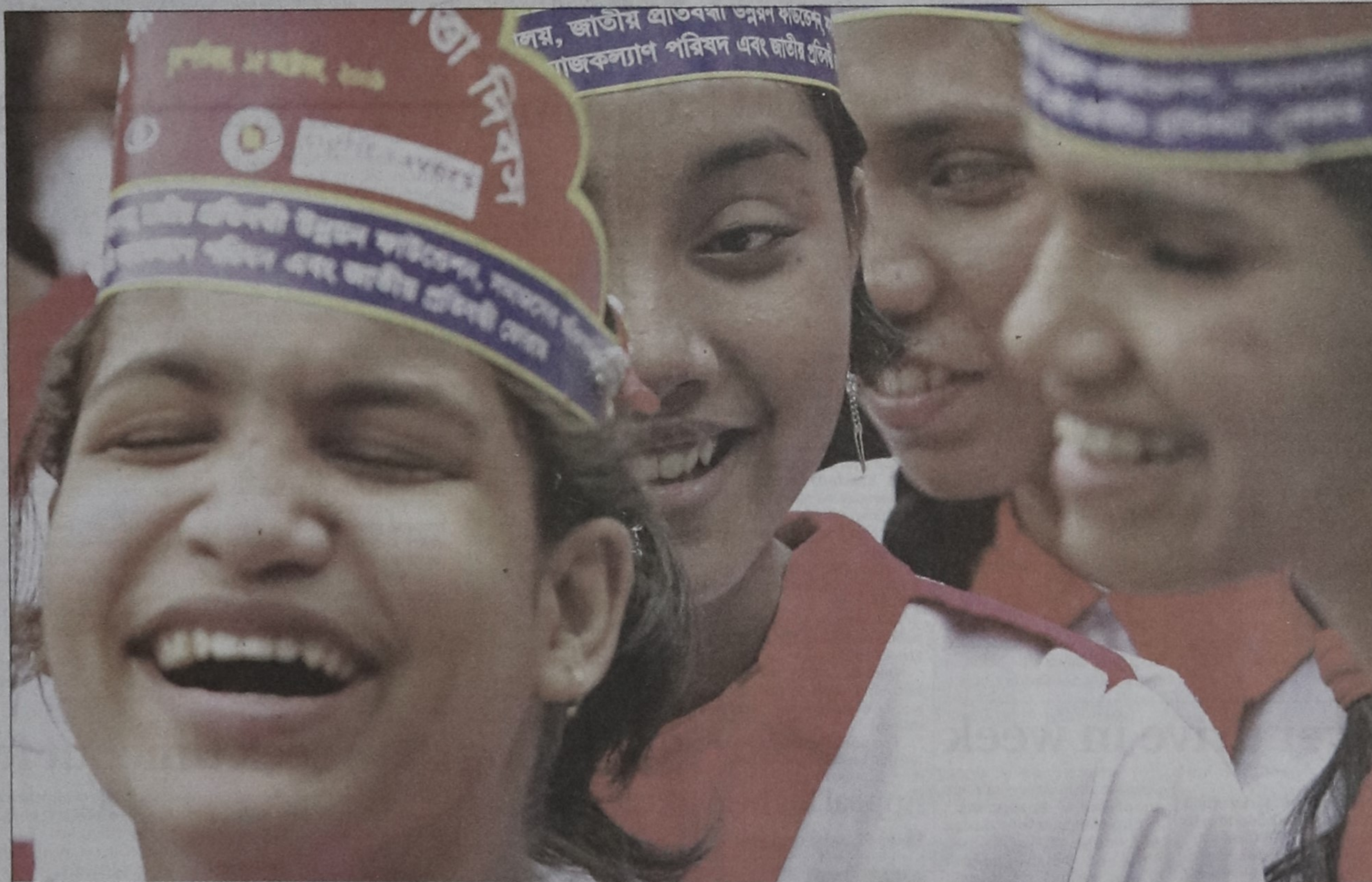
Four visually impaired girls giggle when one of them cracks a joke yesterday at Sher-e-Bangla Nagar in the capital. They were preparing for a procession organised on the occasion of White Cane Safety Day.