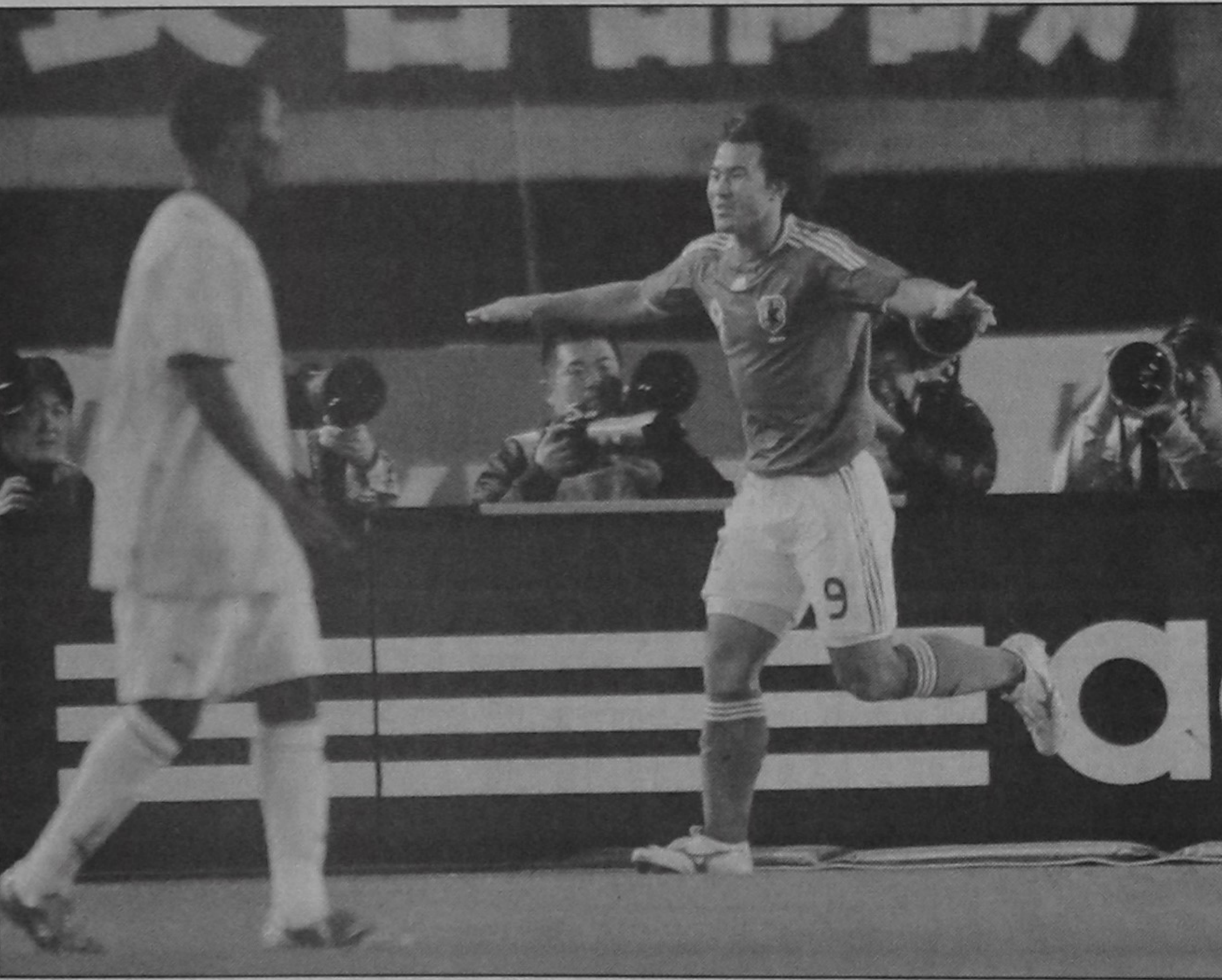
Japan striker Shinji Okazaki (R) celebrates his first goal against Togo during their international friendly in Sendai on Wednesday.

US teen forward Jozy Altidore, who replaced Davies in Saturday's match, typed a series of frowning faces on his twitter page Tuesday afternoon and said, "I'm not tweeting anymore y'all. Just not feeling well."