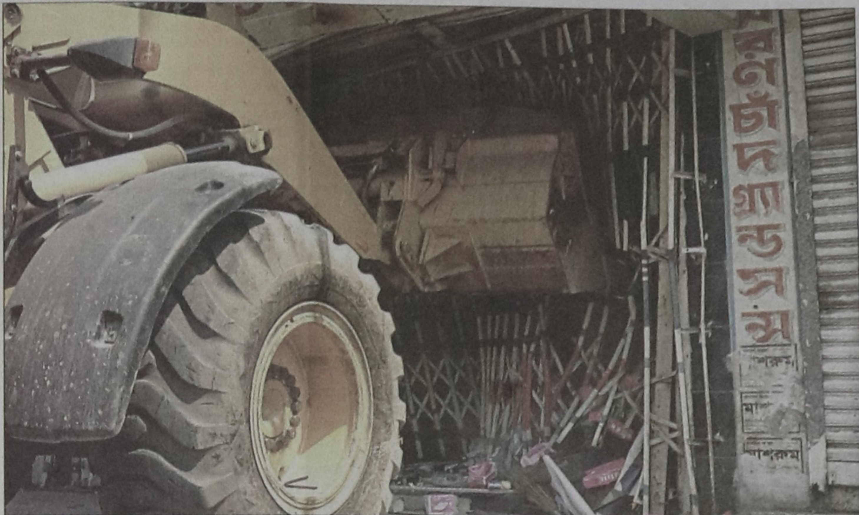
Rajuk bulldozes shops on the ground floor of a building on Mirpur Road in Dhanmondi yesterday. The shops were erected at the designated place for parking cars.