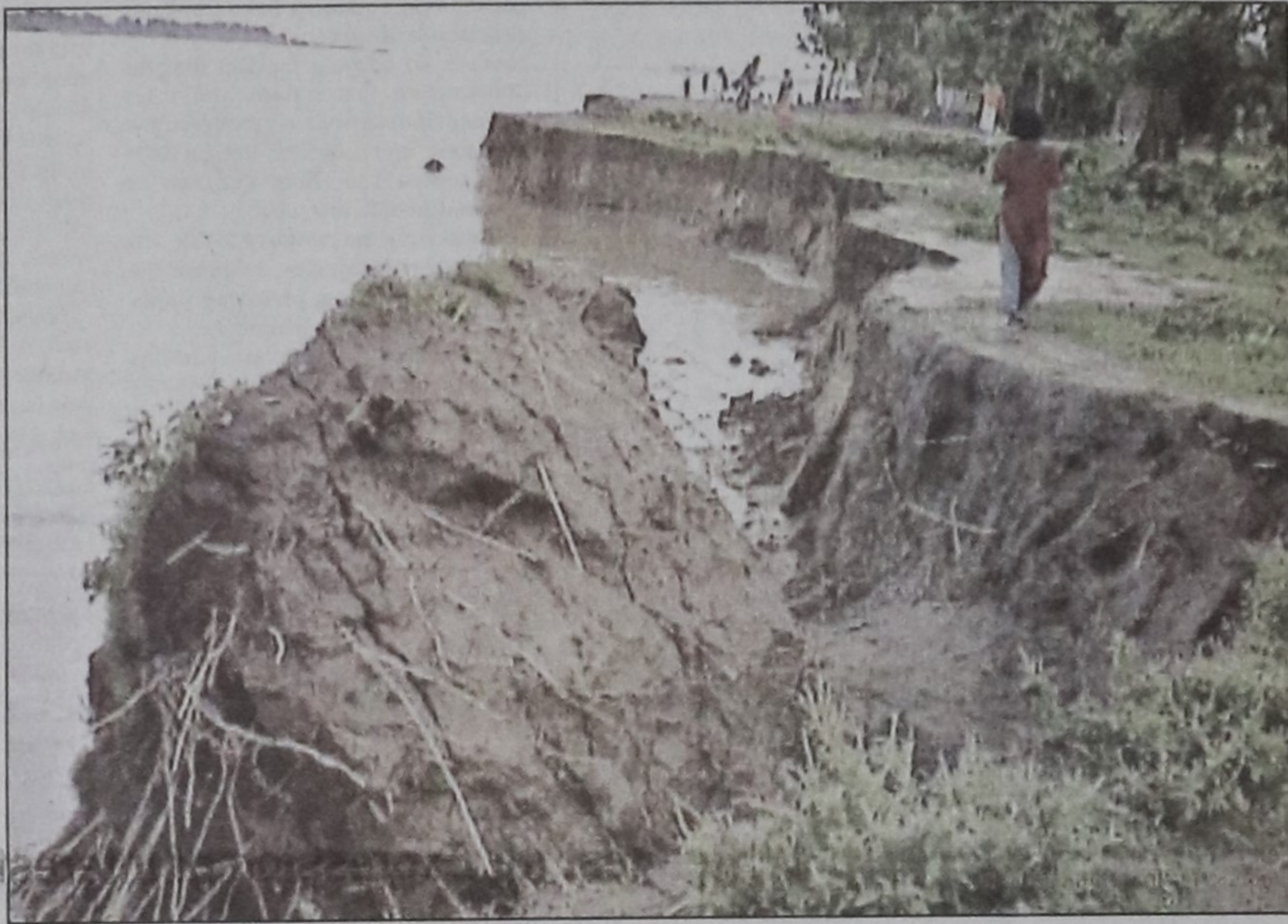
The Teesta continues to devour croplands and homesteads at Kalmati village in Lalmonirhat Sadar upazila as erosion by the river has taken a serious turn in the area.

He suggested ensuring regular intake of meat to meet the protein requirement of the people of the area.