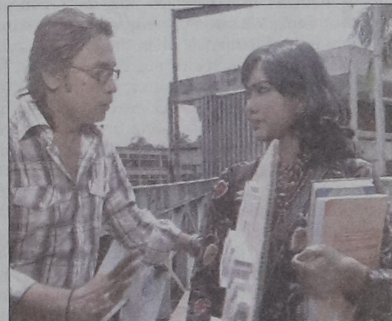
A scene from the serial.

In reality, there are two kinds of women: one that truly cares for her in-laws and