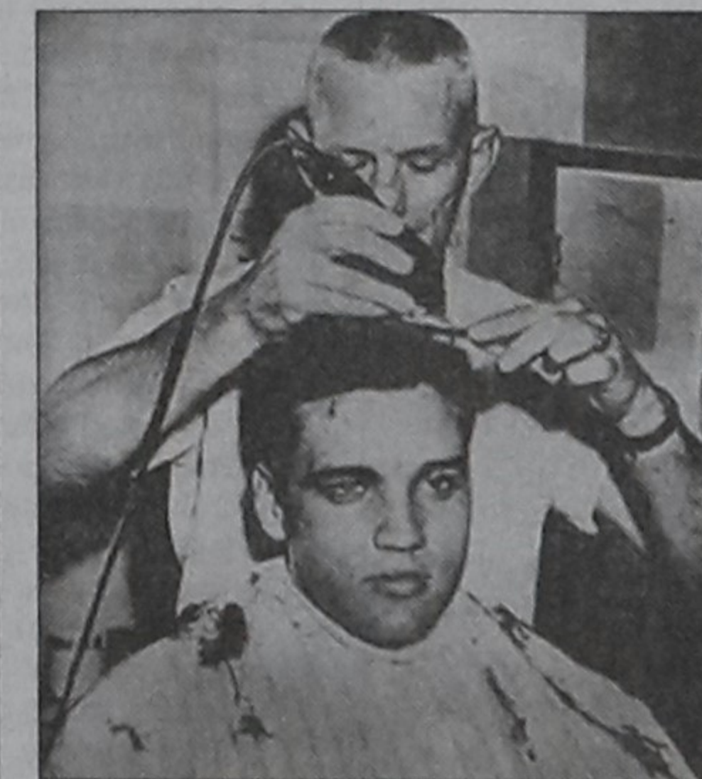
What is a lock of Elvis Presley's hair worth?

The King may be dead, but that doesn't mean it's too late to run your fingers through his hair. Elvis Presley's hair, at least a clump of hair that Presley may have lost to an Army barber when he went into the service back in 1958, is going on the auction block on October 18 at Leslie Hindman Auctioneers in Chicago.