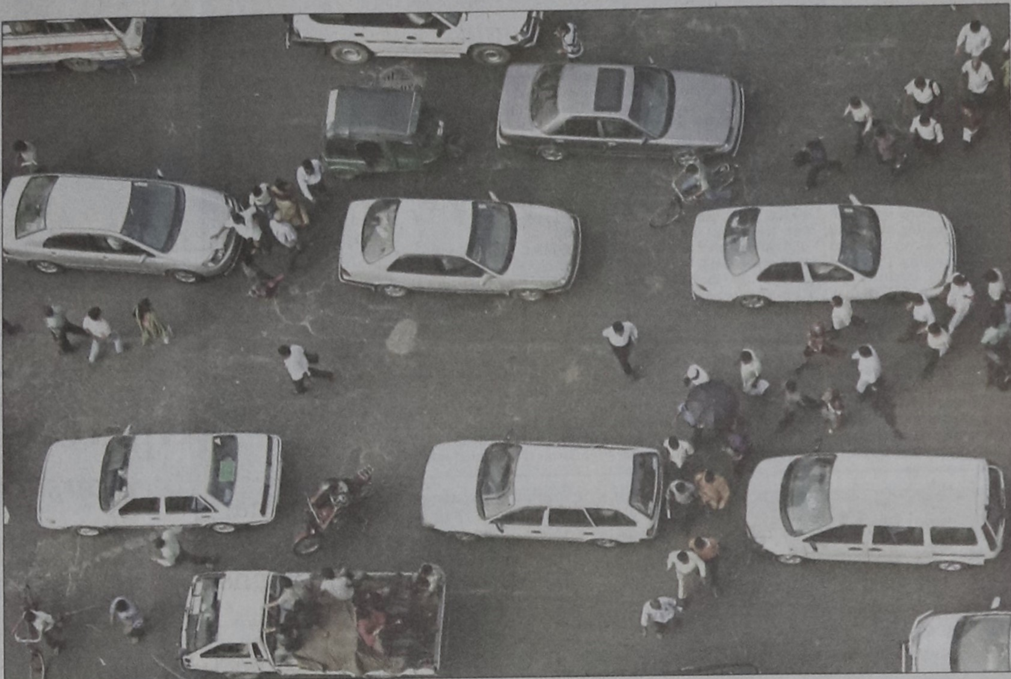
A large number of pedestrians refuse to use the three footbridges at Farmgate and opt for crossing the busy Kazi Nazrul Islam Avenue in such free style, slowing down traffic and in cases grinding it to a halt.