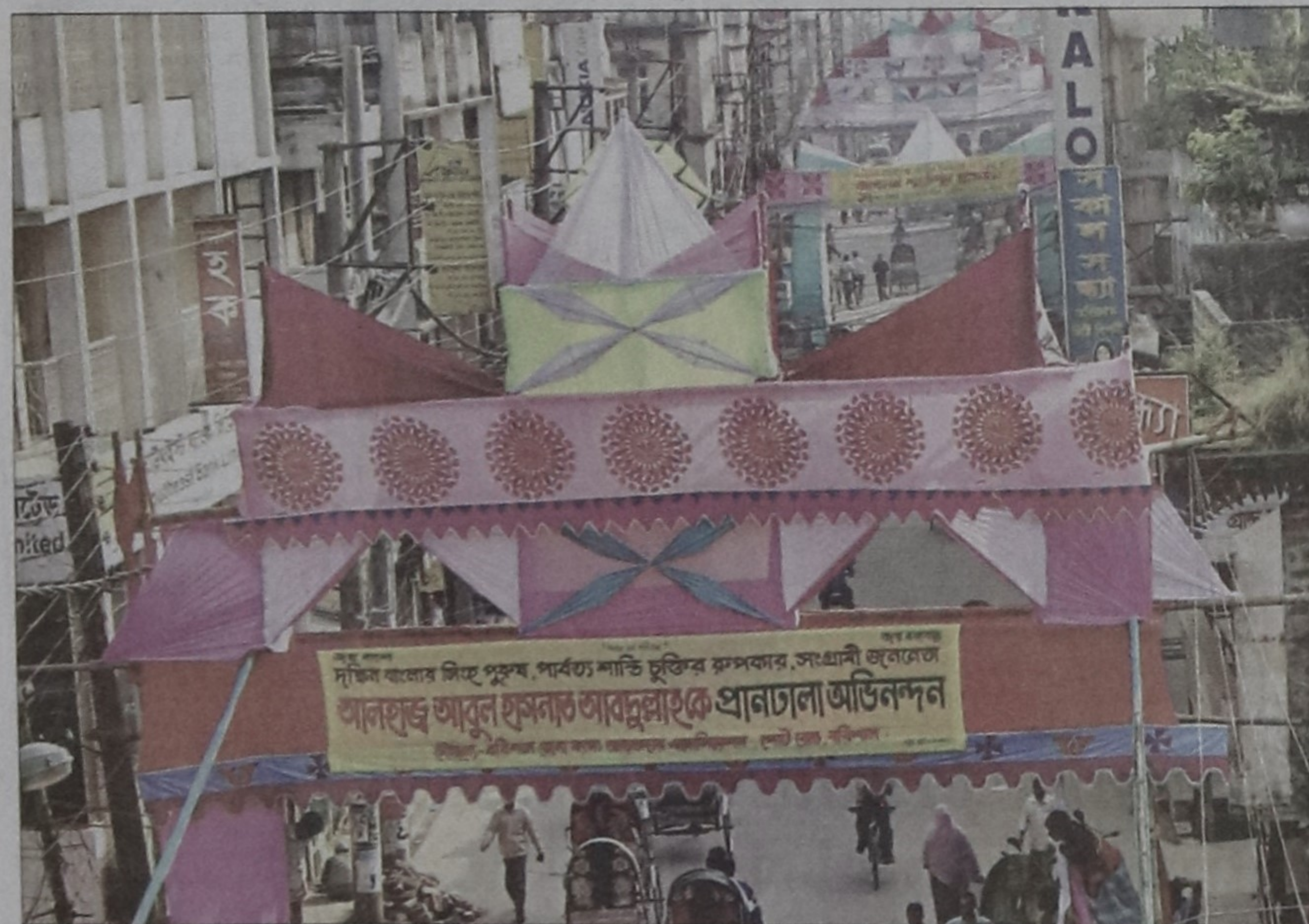
Barisal Fish Warehouse Operators' Association builds an arch in the divisional city welcoming Awami League leader Abul Hasnat Abdullah. Over 100 arches were set up in the city on the leader's return to Barisal after eight years.