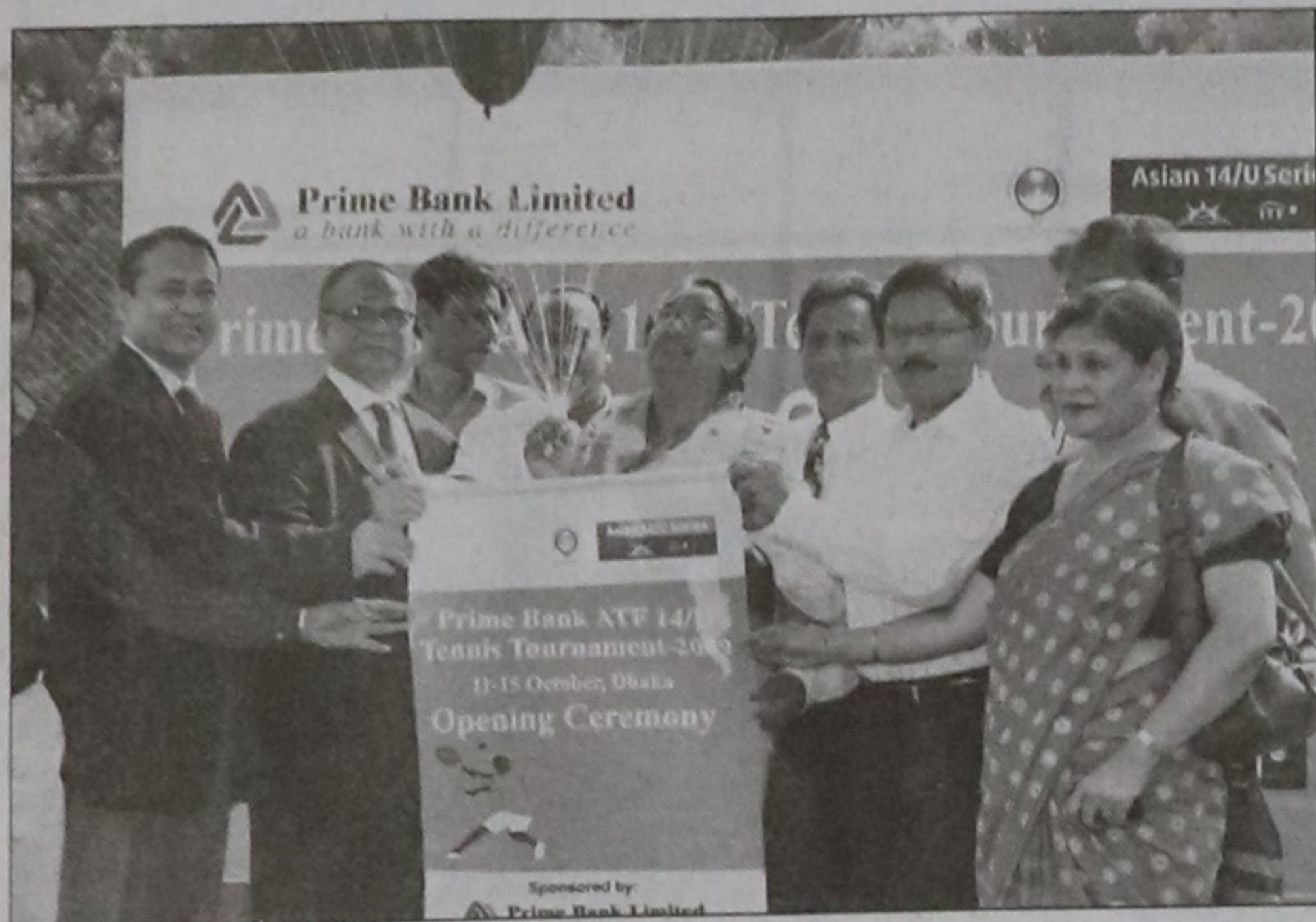
Foreign Minister Dr. Dipu Moni (C) inaugurates the Prime Bank ATF Under-14 Tennis Tournament 2009 at the Ramna National Tennis Complex yesterday.