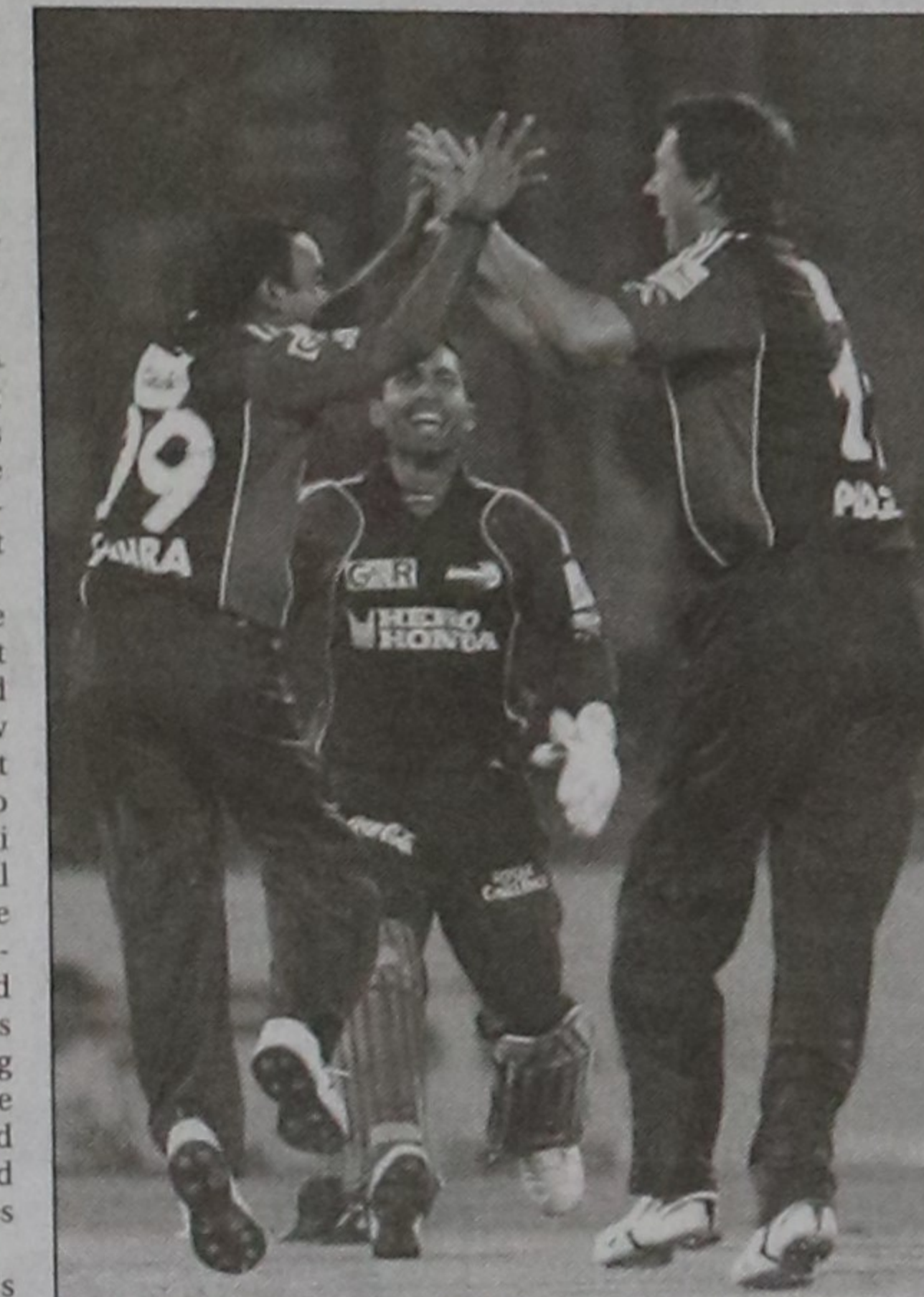
Delhi Daredevils bowler Glenn McGrath (R) celebrates with teammates Amit Mishra (L) and Dinesh Karthik after taking a wicket of Wayamba Eleven in their Champions League match at the Feroze Shah Kotla Stadium on Sunday.

BRIEF SCORES Delhi Daredevils 170 for 5 (Sehwag 66, Karthik 61) beat Wayamba 120 for 7 (Jayawardene 54, Nannes 4-24, McGrath 2-20) by 50 runs