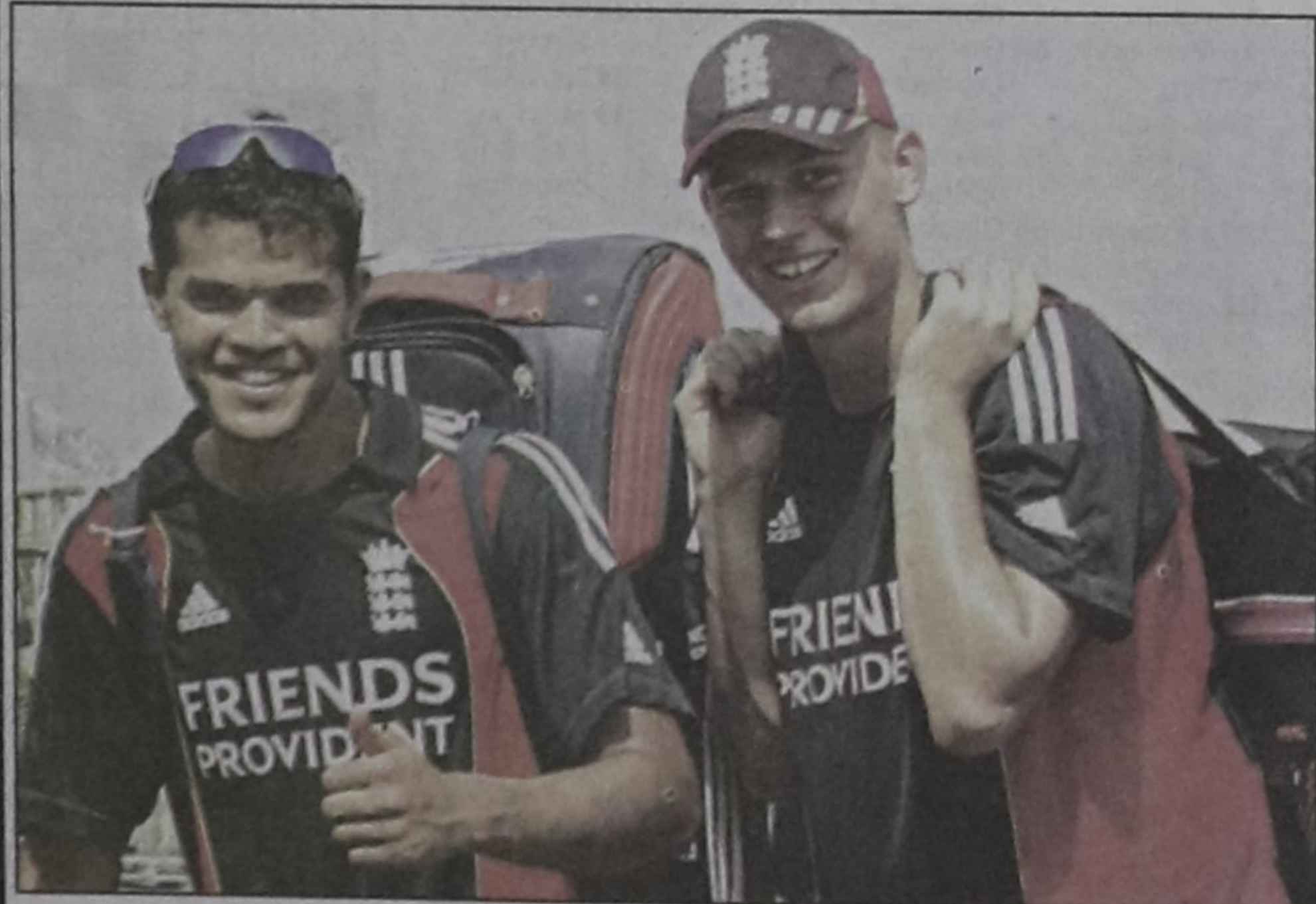
Two England Under-19 players leave the Fatullah Stadium yesterday smiling with a hope that today's unscheduled limited-overs match at the Sher-e-Bangla National Stadium will give them some cricket. A two-day practice match against a BCB U-19 XI was scheduled to start yesterday but was abandoned due to wet ground condition.