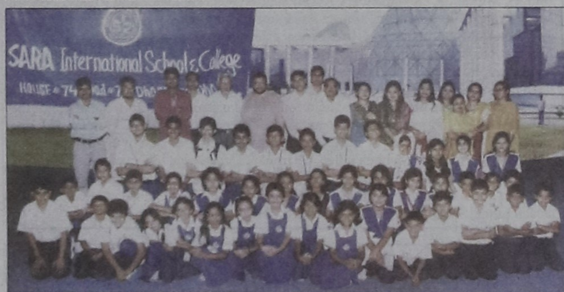
Students of Sara International School and College at Dhanmondi and their teachers pose for photograph during their educational tour at Bangabandhu Sheikh Mujibur Rahman Novotheatre in the city recently.

The people in the region expect that rice variety would help them get rid of the curse of 'Monga' in the months of Ashwin and Kartik.