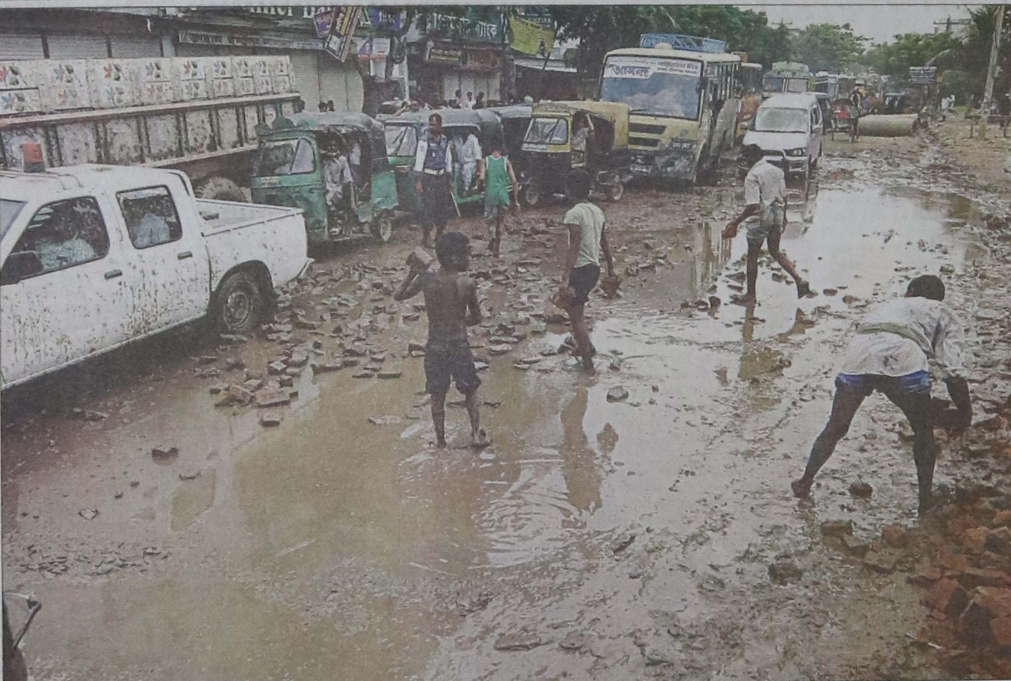
Tired of waiting for the authorities to mend this road at Kadamtola in Keraniganj near the Second Bangladesh China Friendship Bridge, locals try to repair it with bricks yesterday.