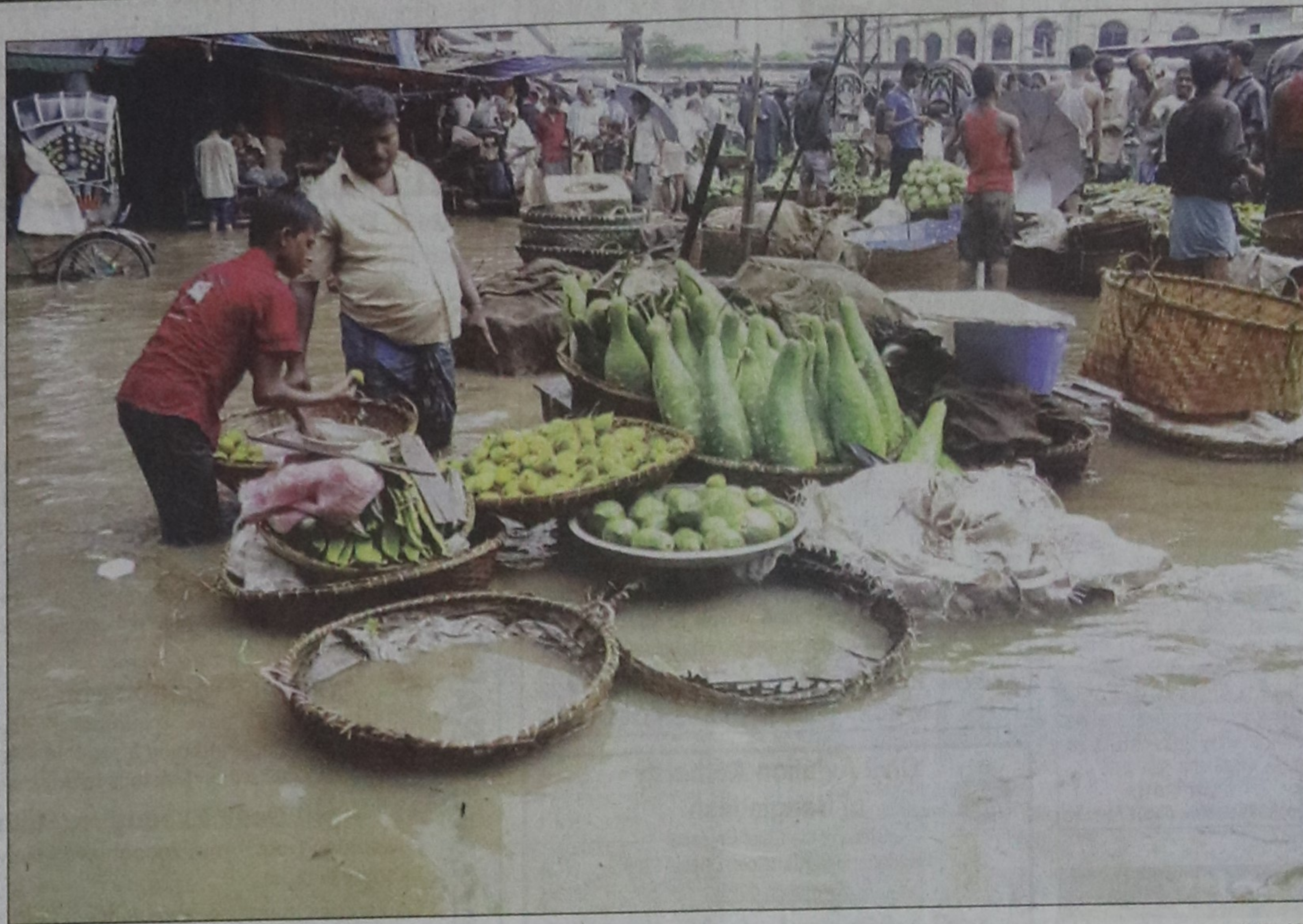
Chakbazar area in the port city of Chittagong goes under knee-deep water yesterday as heavy rain accompanied by lightning has been battering most parts of the city since Thursday midnight due to deep convection over the North Bay.

The International Inspiration Project aims to transform the lives of 12 million children and young people of all abilities, in schools and communities across 20 developing countries worldwide, through the power of high quality and inclusive physical education, sport and play.