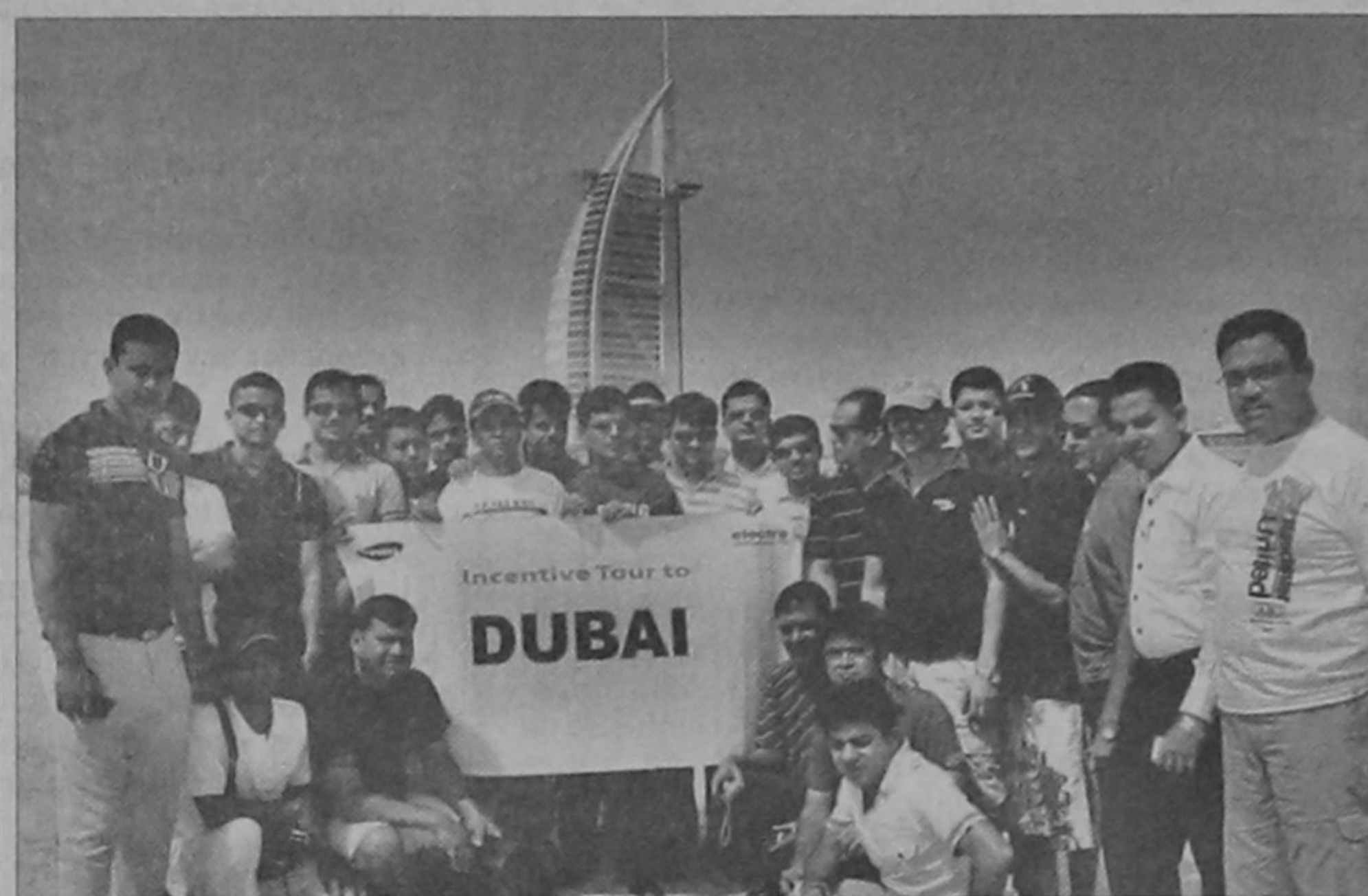
ELECTRA TELECOM BD