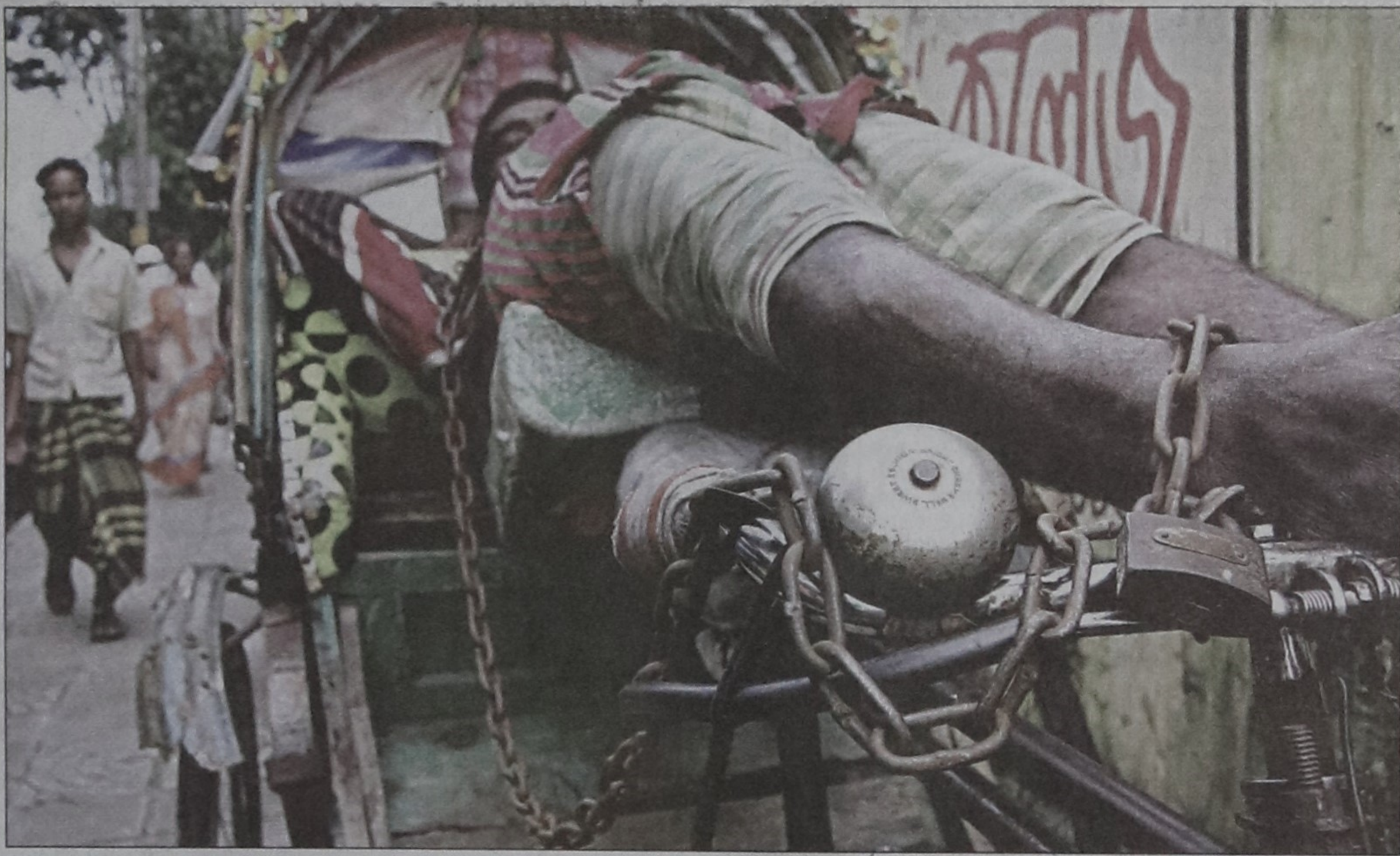
A rickshaw puller takes a nap yesterday chaining himself to his rickshaw near Dhaka Medical College Hospital to prevent it from getting stolen. On Wednesday, criminals killed a rickshaw puller in the capital's Agargaon and made away with the rickshaw.