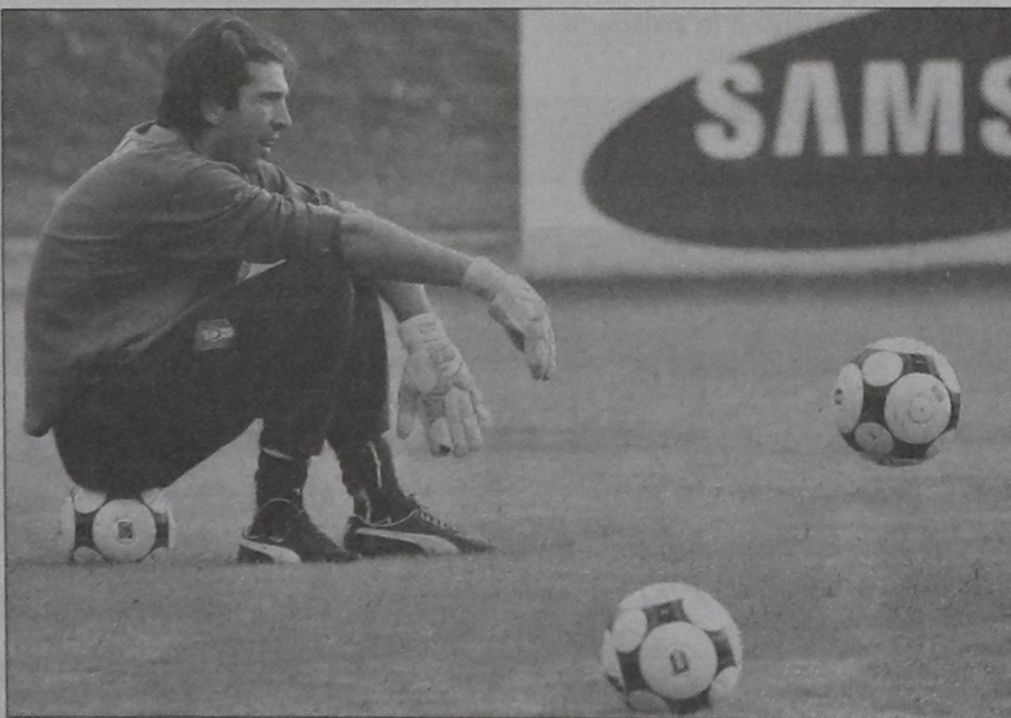
Italy goalkeeper Gianluigi Buffon takes rest during a training session in Florence on Wednesday. Italy take on Ireland in a 2010 World Cup qualifier on Saturday.

Portugal, who are third in Group One with 13 points, need to win both matches and for second-placed Sweden to slip up in Denmark, to book their ticket to the finals in South Africa next year.