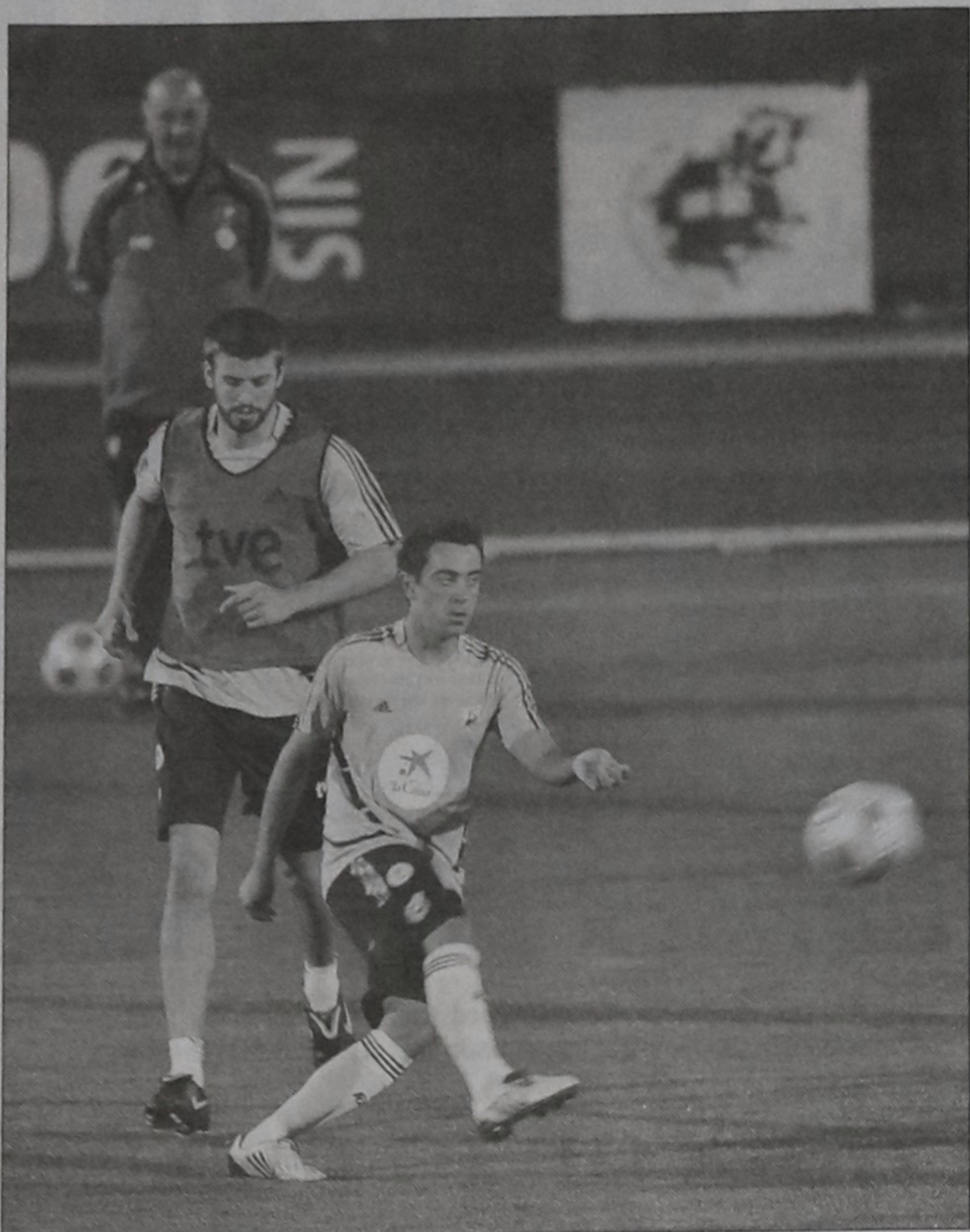
Spain midfielder Xavi Hernandez (R) kicks the ball during a training session in Las Rozas on Tuesday. Spain face Armenia in a 2010 World Cup qualifier on Saturday.

Germany lead their qualifying group and could book their ticket to the finals if they win on Saturday. Even a draw would be enough if they beat Finland in their last match next Wednesday.