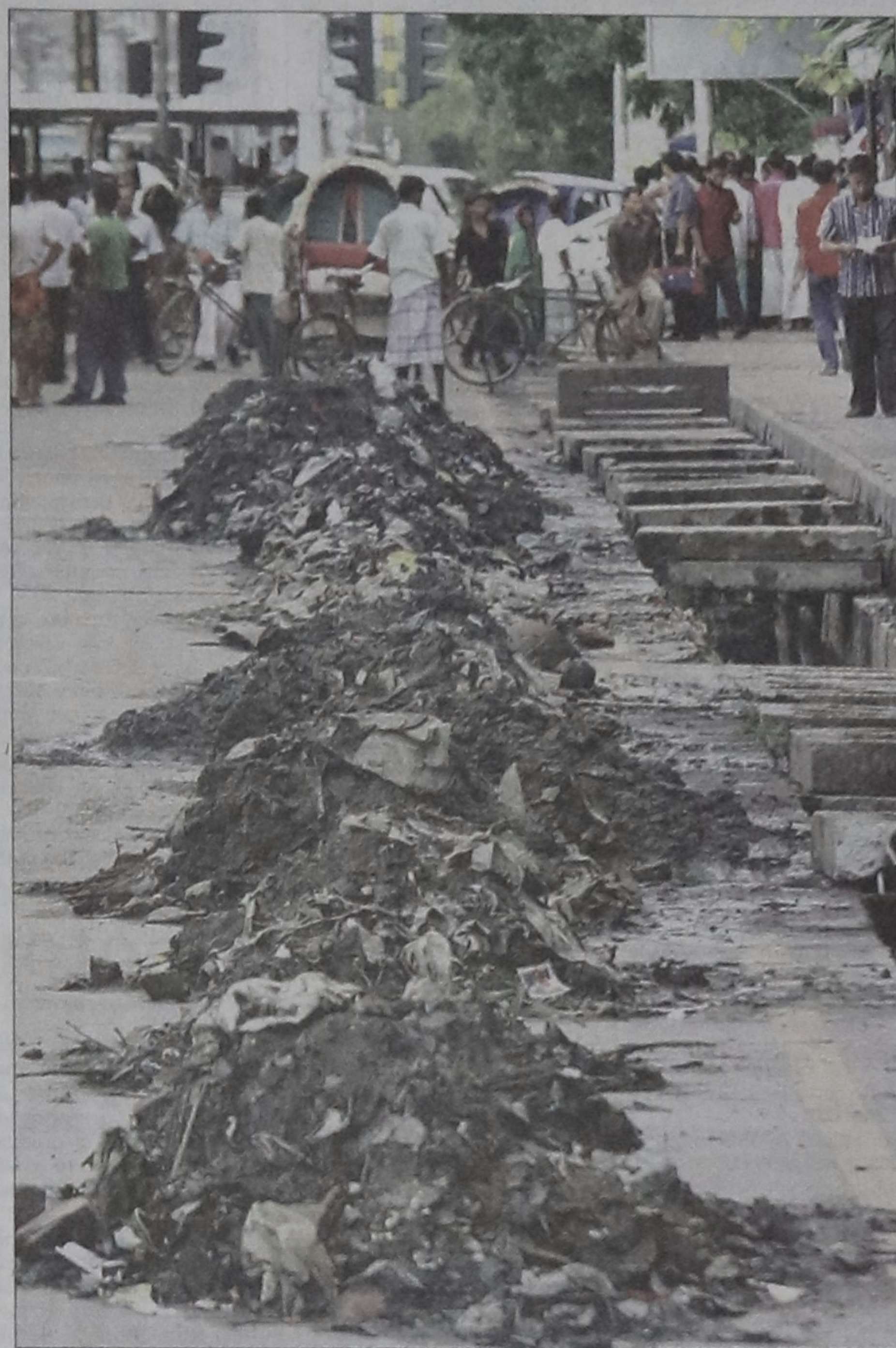
This photo taken recently shows filth extracted from the storm water drainage system and left on a street in Baridhara, a posh area in the capital. Practice of this sort is seen elsewhere in the city as well.