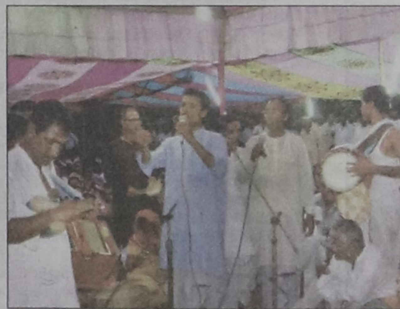
A duel of words between two rival bards.