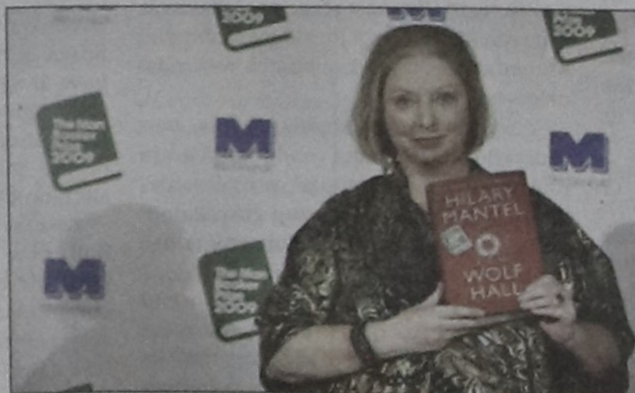
British author Hilary Mantel, winner of the 2009 Man Booker prize.