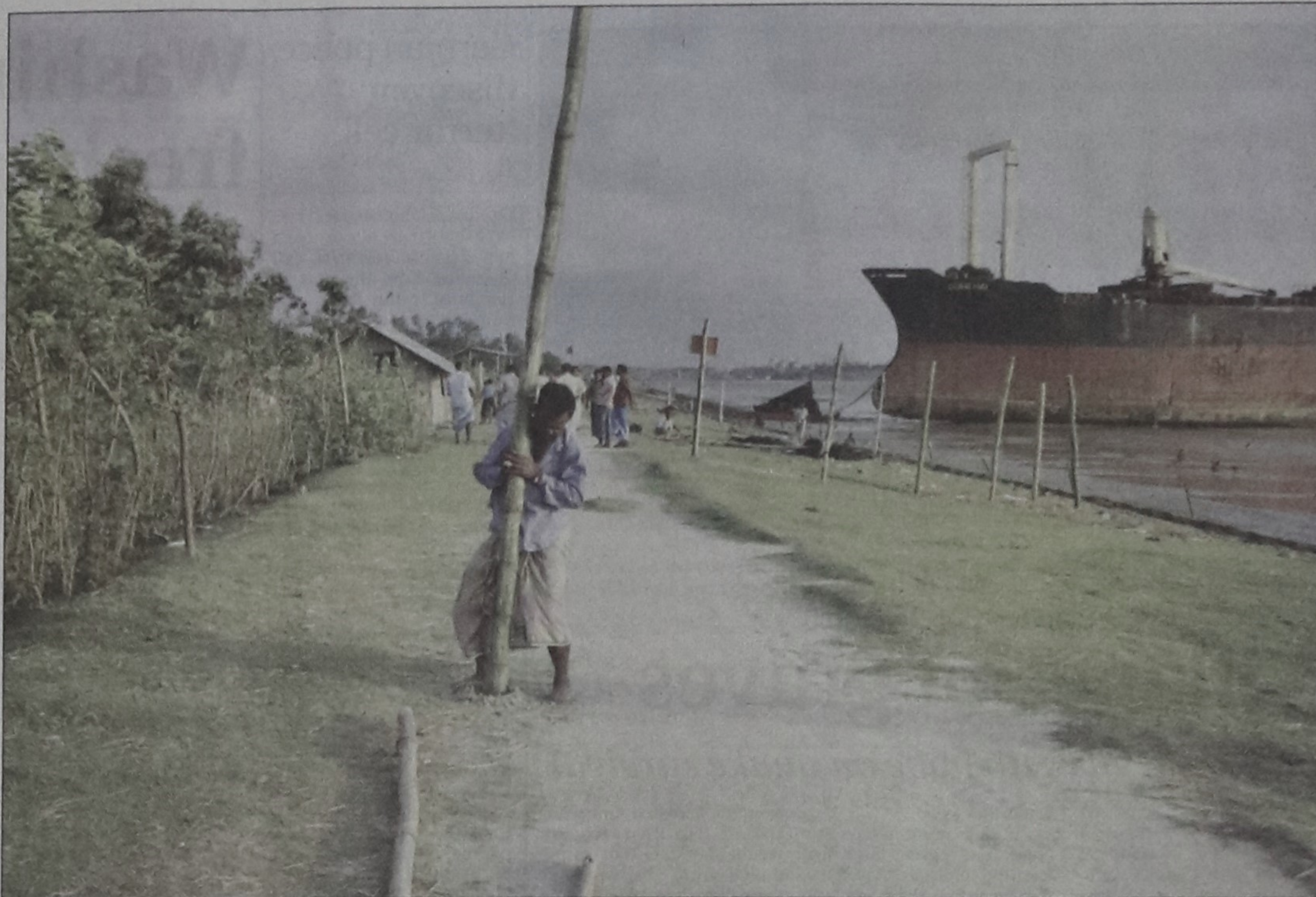
A worker erects a fence around occupied land at a ship-breaking yard at Sitakunda in Chittagong yesterday. (Story on Page 16)

"Our government is committed to upholding the spirit of secularism in order to build a happy and prosperous Bangladesh," he said.