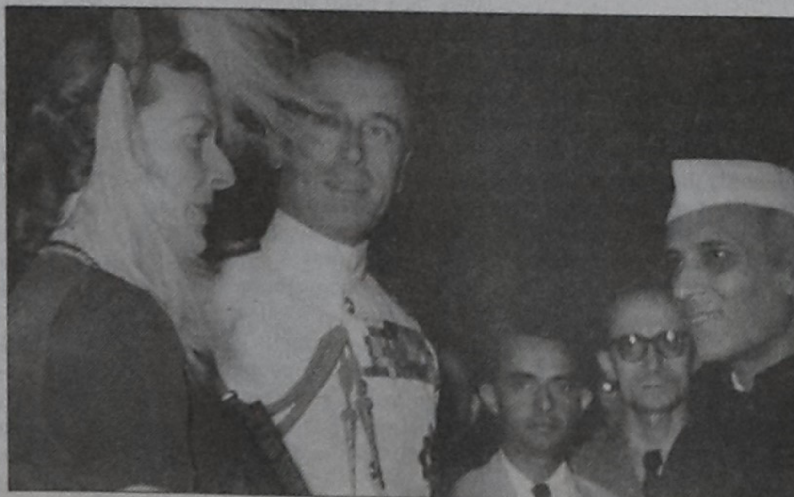
(From left) Edwina Mountbatten, Lord Mountbatten and Jawaharlal Nehru.

In case the producers accept the conditions and decide to shoot the film in India, an officer will be attached to the shooting unit to ensure adherence to the script approved by the government.