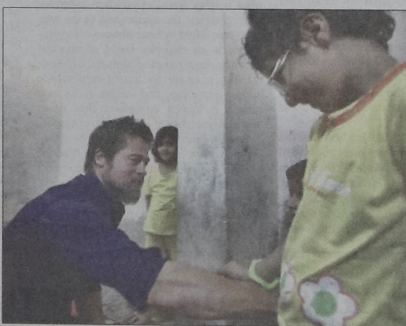
Brad Pitt with refugee children in Syria.