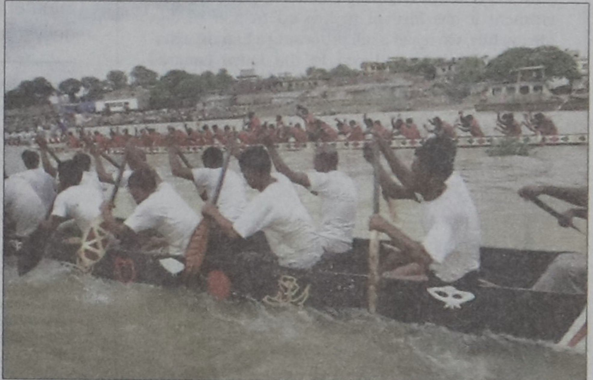
Boat race on the Surma river.