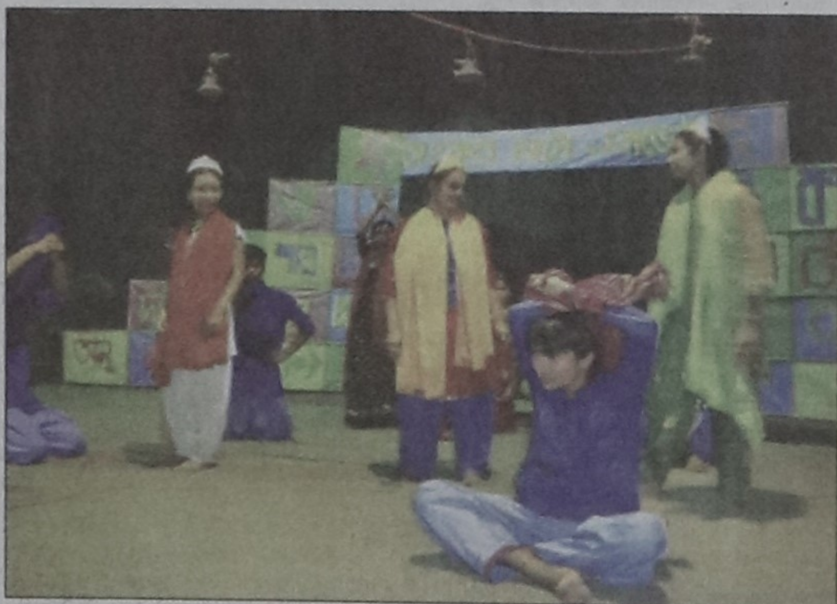
Actors in "Gazir Pala".