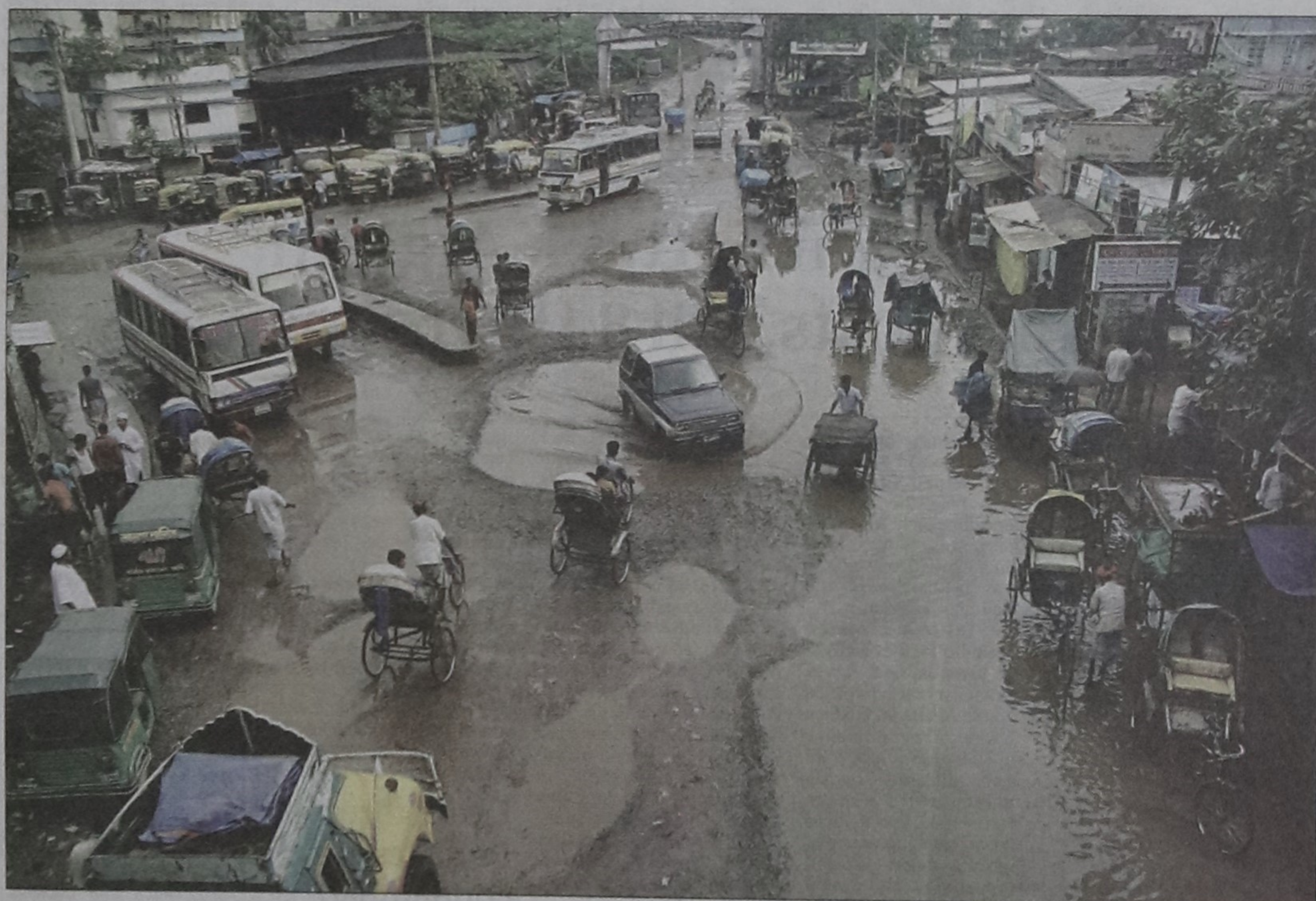
This busy road near Postagola Buriganga Bridge has long been in a dilapidated condition due to negligence of the authorities, causing untold sufferings to people.