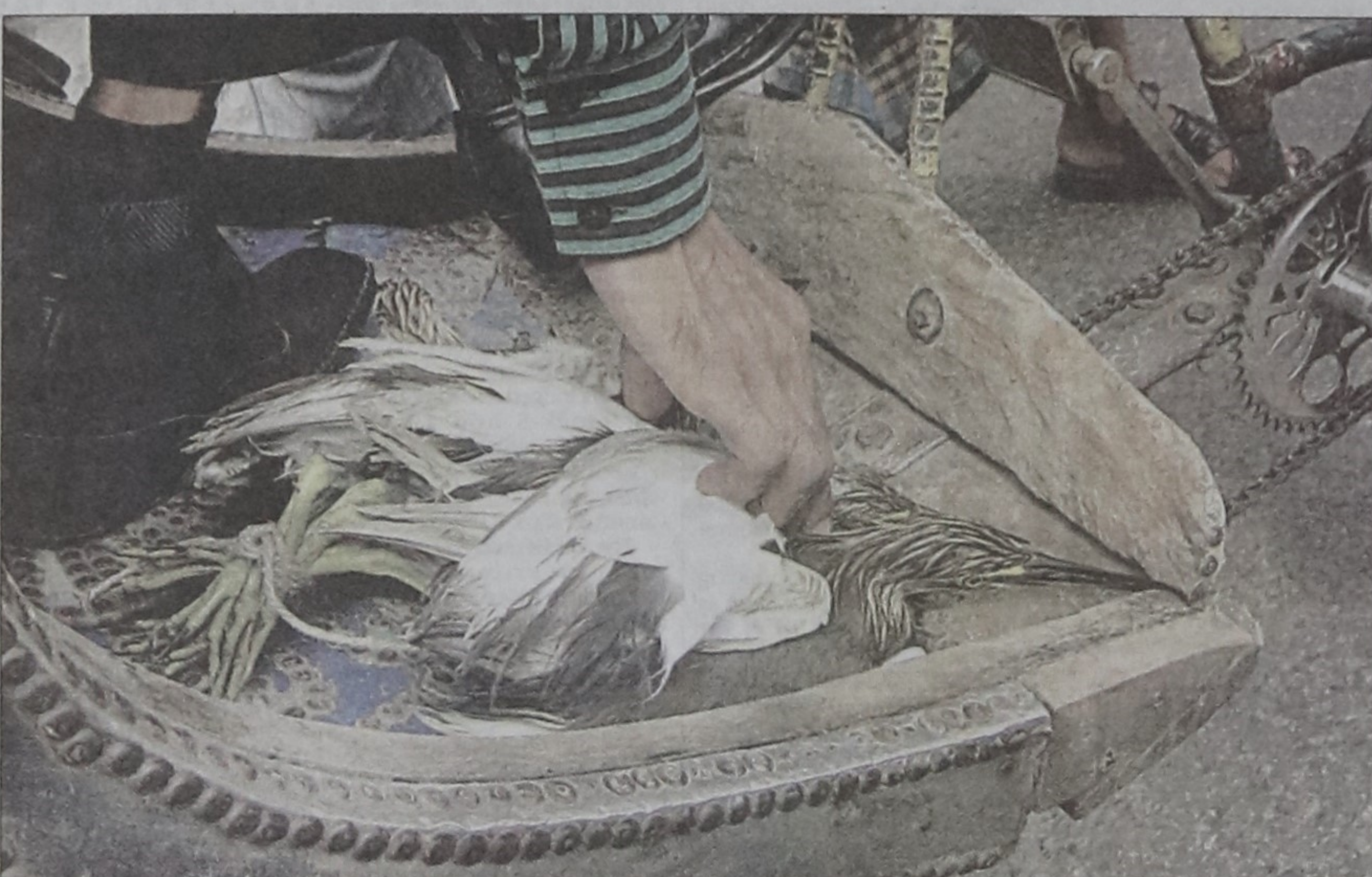
A man is taking home a few pond herons he bought at Farkirerpul in the capital yesterday. The country's law prohibits capture, sale and consumption of such birds.