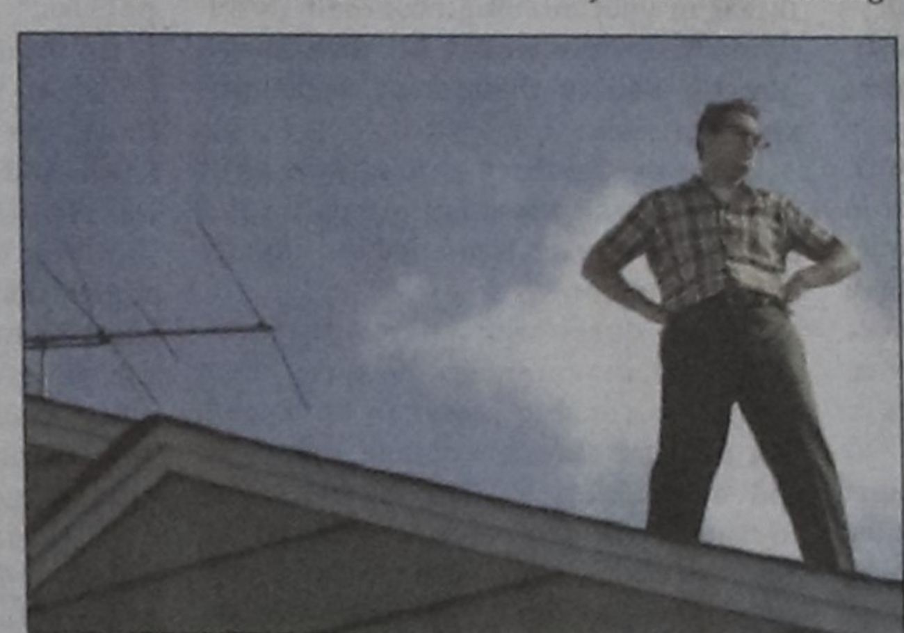
The film harks back to the Coens' childhood.