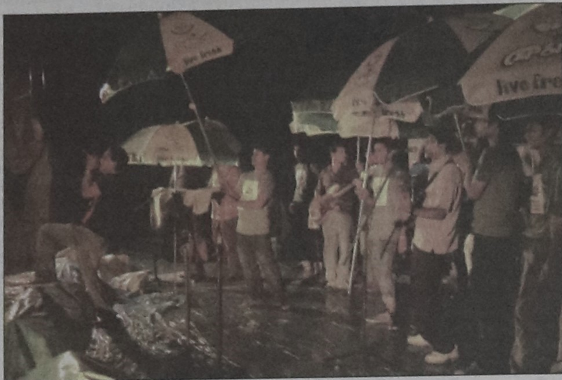
Feedback performs under umbrellas at the concert.

The band Inside U started off the show, and fans started to gather around the stage. Warfaze followed after some delay. All members of the rock band wore black. The musicians performing under a dark sky and recurring lightning was a spectacular sight. When it was Feedback's time, it really started to pour. But it didn't deter the guys from performing.