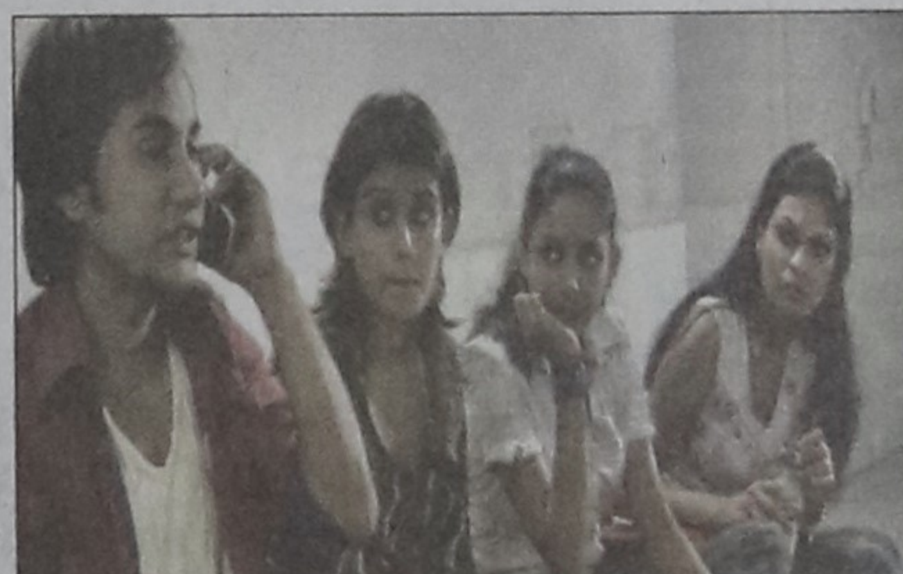
A scene from the serial.