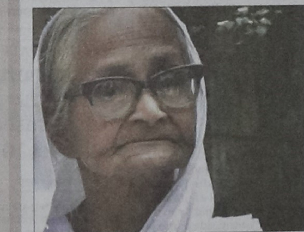
Kandeey Amar Ma On ATN Bangla at 5:15 pm Documentary on the Liberation War