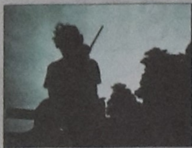
Photo Exhibition On the occasion of 60 th birth anniversary of Werner Herzog Title: Film Must be Physical Venue: Goethe-Institut Bangladesh, H 10, Rd 9, Dhanmondi Date: Sep 16-Oct 8

Artist: Shahabuddin Venue: Gallery Chitrak, H 21, Rd 4, Dhanmondi Date: September 18-Oct 9 Time: 10am-1pm, 5-8pm