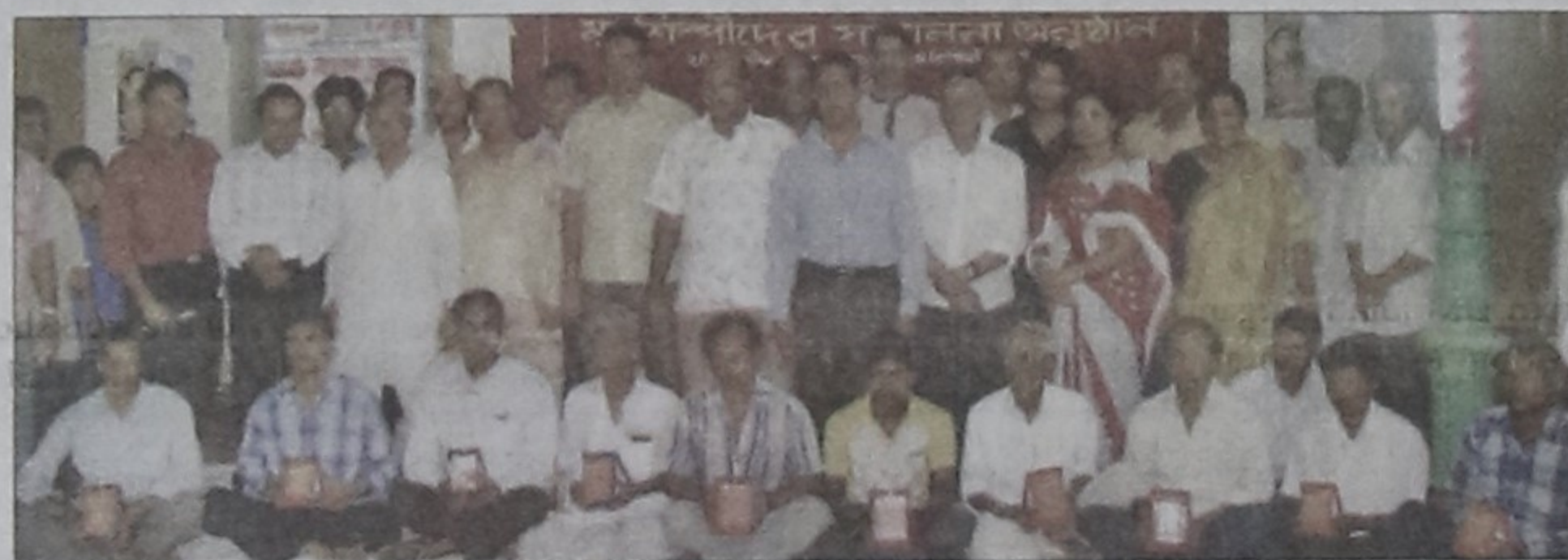
Artisans with their crests at the programme.

Puja mandap were beautifully decked with elaborate decorations and colourful lights, while cultural functions were held in almost every mandap.