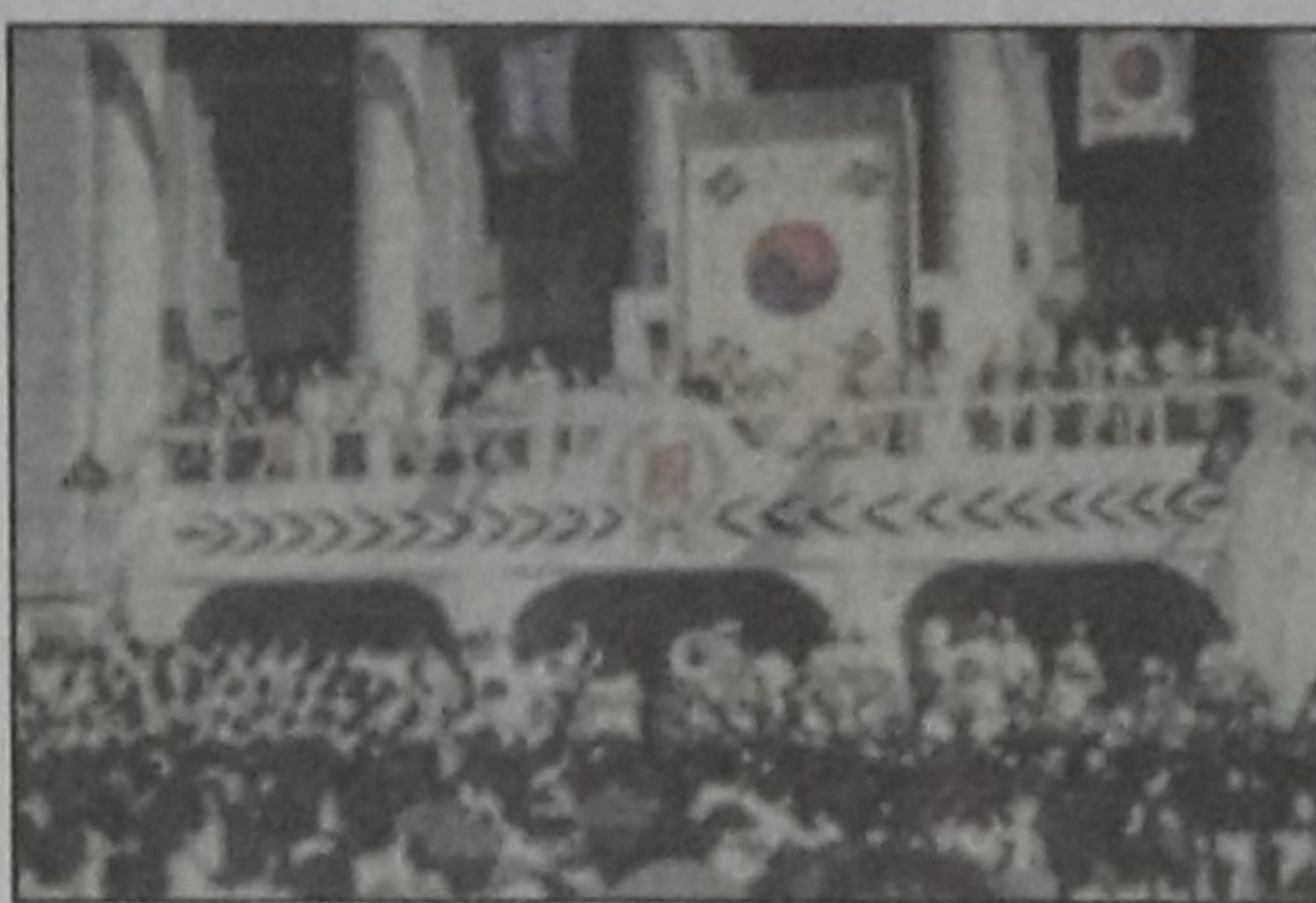
The inaugural ceremony of the Republic of Korea in 1948

There was the revolutionary event in 1948 -- the founding of the nation -- and 60 years of the revolutionary modernisation of the Republic. There have been a number of historic revolutionary events throughout the world: the French Revolution in 1789, the Industrial Revolution in the 18th century in the United Kingdom and