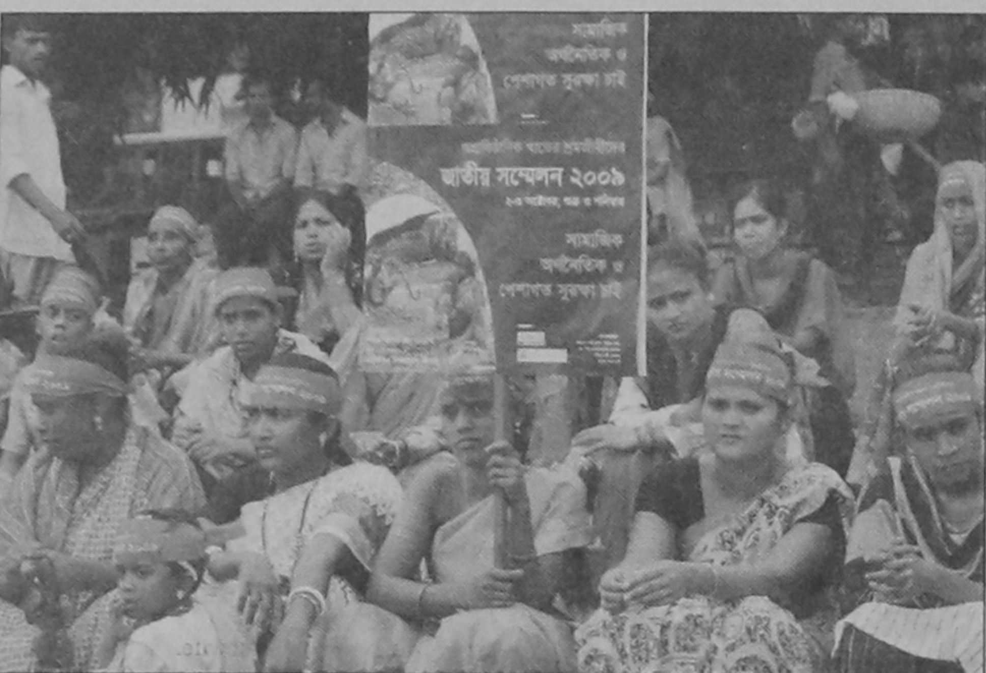
Nagorik Uddyog and Partnership of Women in Action jointly organised the national conference of workers in the non-formal sector at Rabindra Sarobar in the city yesterday.

But none was arrested in this connection so far.