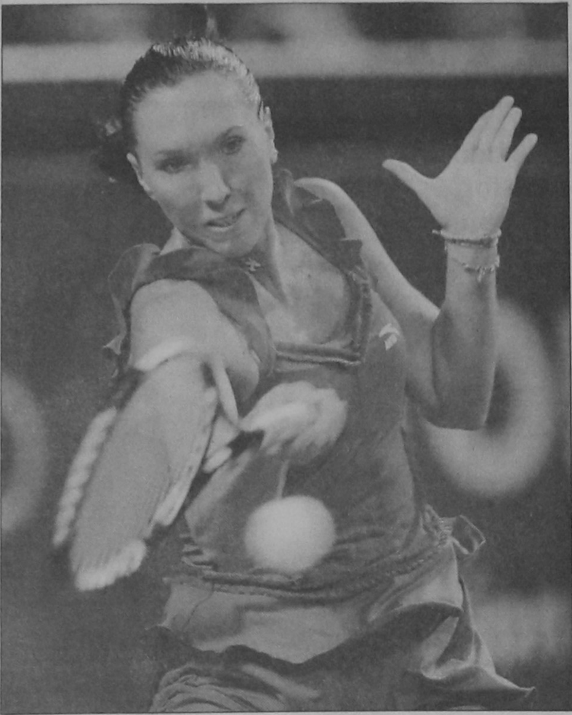
Jelena Jankovic of Serbia makes a return against Elena Vesnina of Russia during their third round match of the Pan Pacific Open in Tokyo yesterday.

The first basketball game was held on January 20 in 1892. The court was half the size of courts used at the NBA League nowadays and only one point was scored in the whole match. In this game, there were nine players in each team.