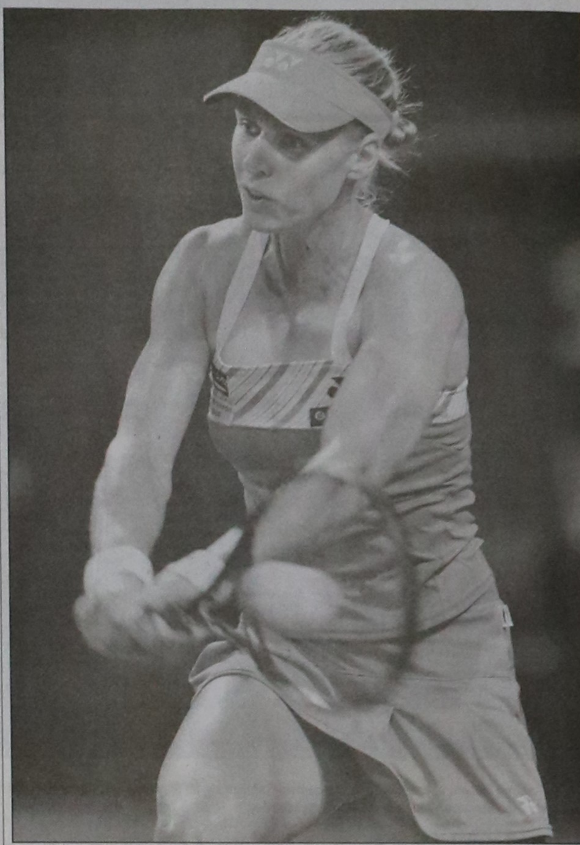
Elena Dementieva of Russia hits a double-handed return against Kateryna Bondarenko of Ukraine during their second round match at the Pan Pacific Open in Tokyo yesterday.

It also approved the BFF Disciplinary Code and decided to defer the proposed National Football Championship in October by a few months.