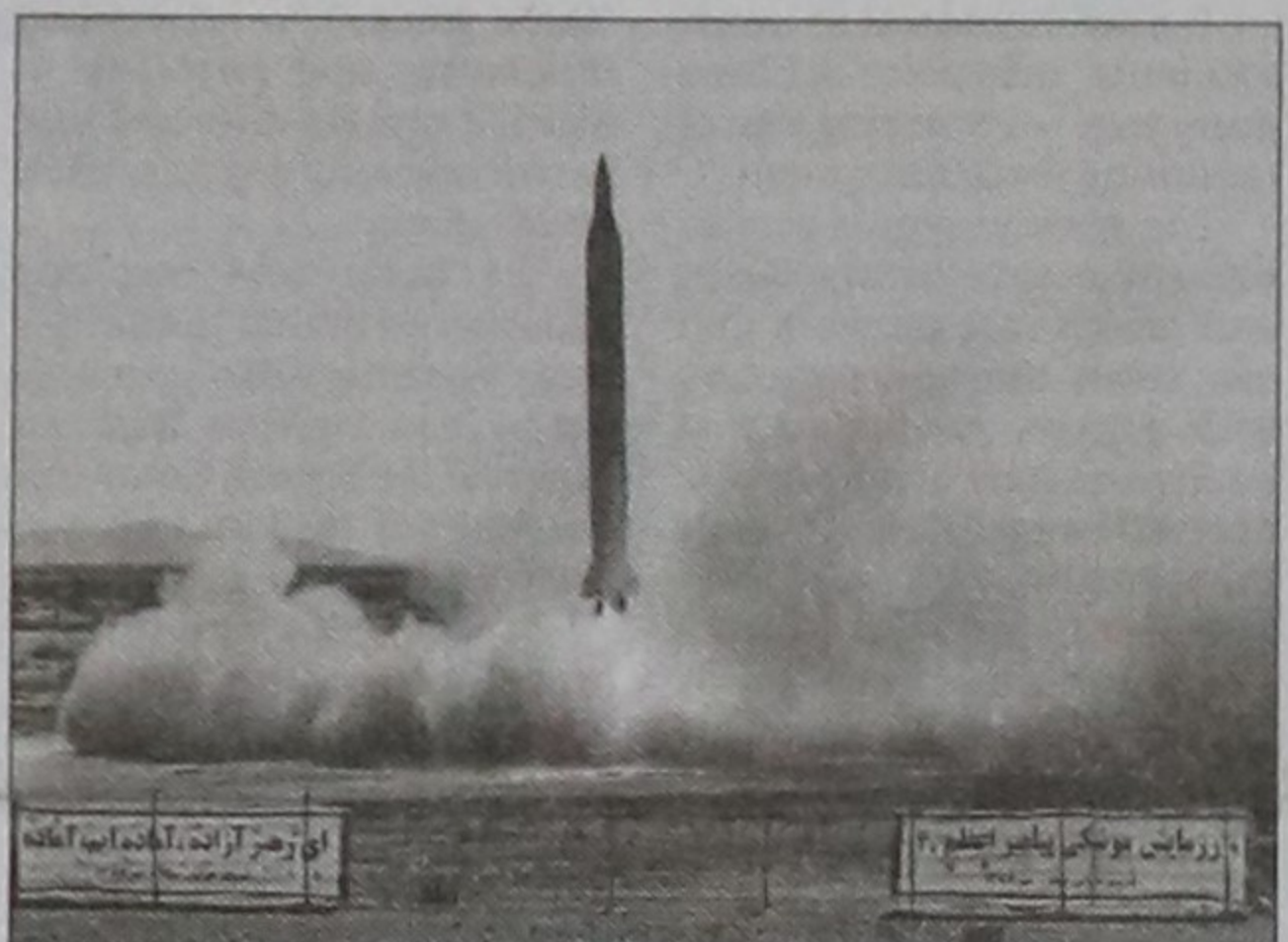
An Iranian long-range Shahab-3 missile is fired in desert terrain at an unspecified location in Iran yesterday.

He said the missile exercise was aimed at practising for "long wars, moving the missile installations from one point to another as well as simulta-