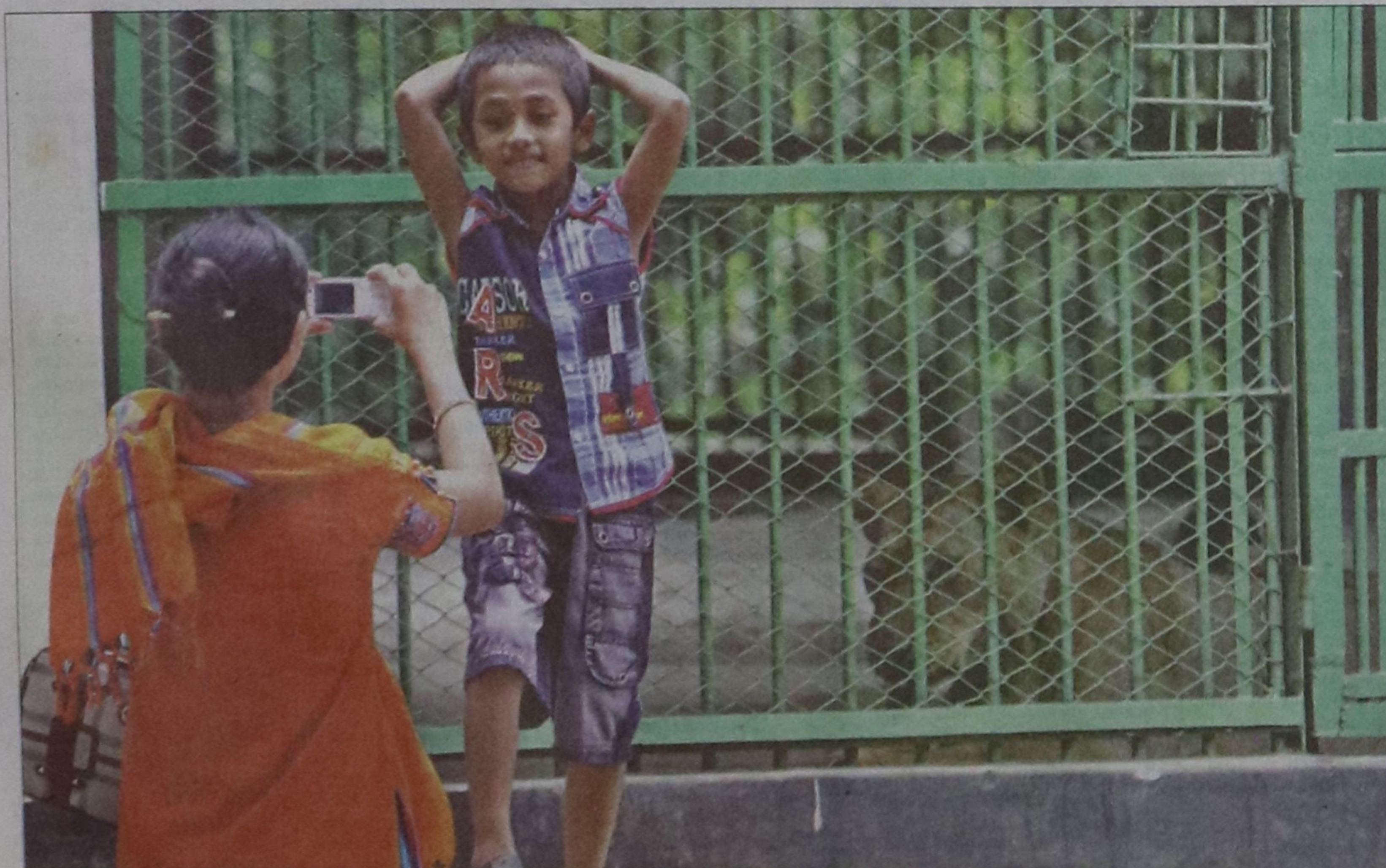
Visitors often cross the cage boundary of animals at Dhaka Zoo in the capital violating the warnings and pose for photos. This child is standing very close to a lion's cage.