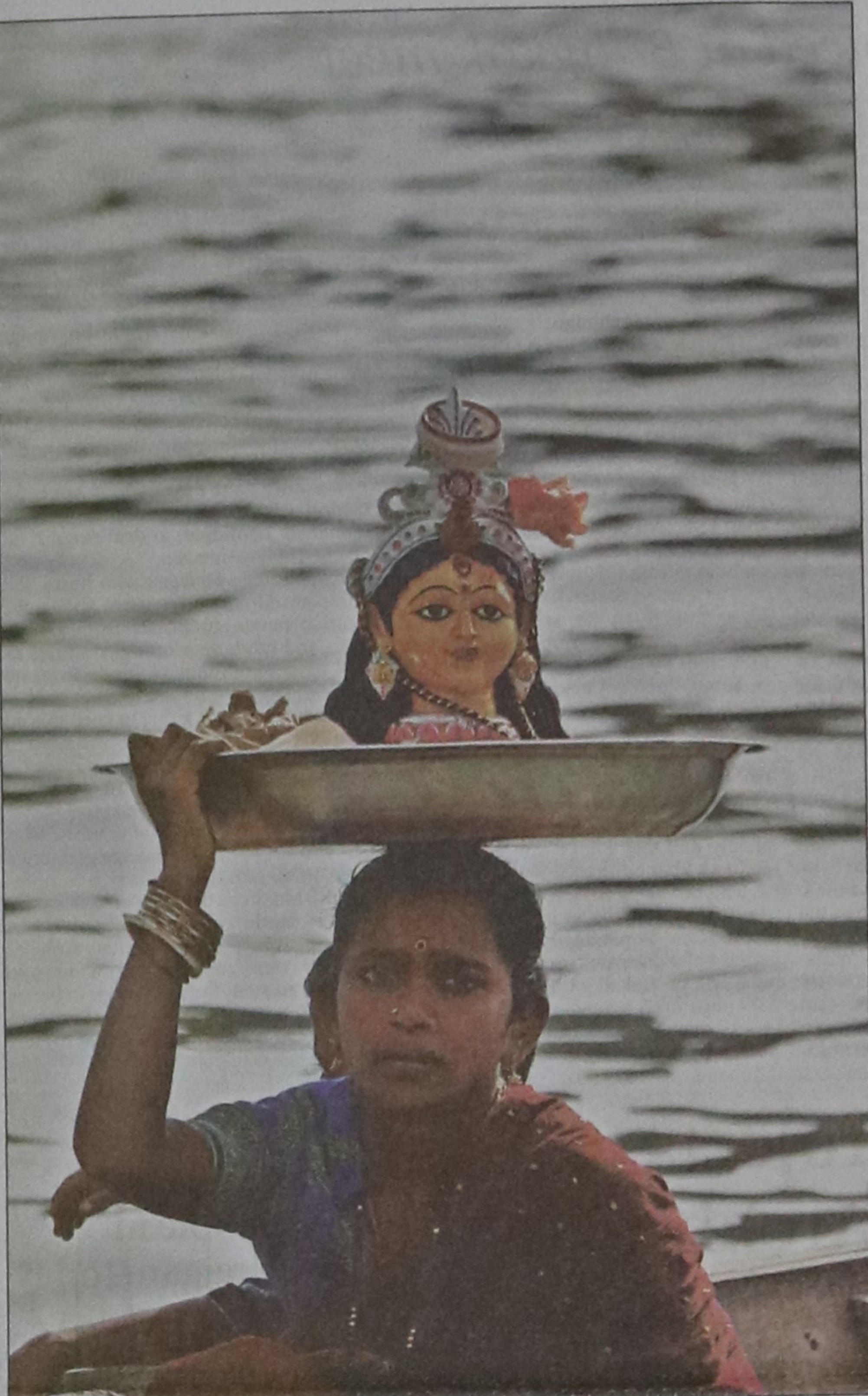
A Hindu devotee on a boat on the Buriganga gets ready to immerse her Durga idol on the day of Doshomi, the last day of Durgotsab yesterday.