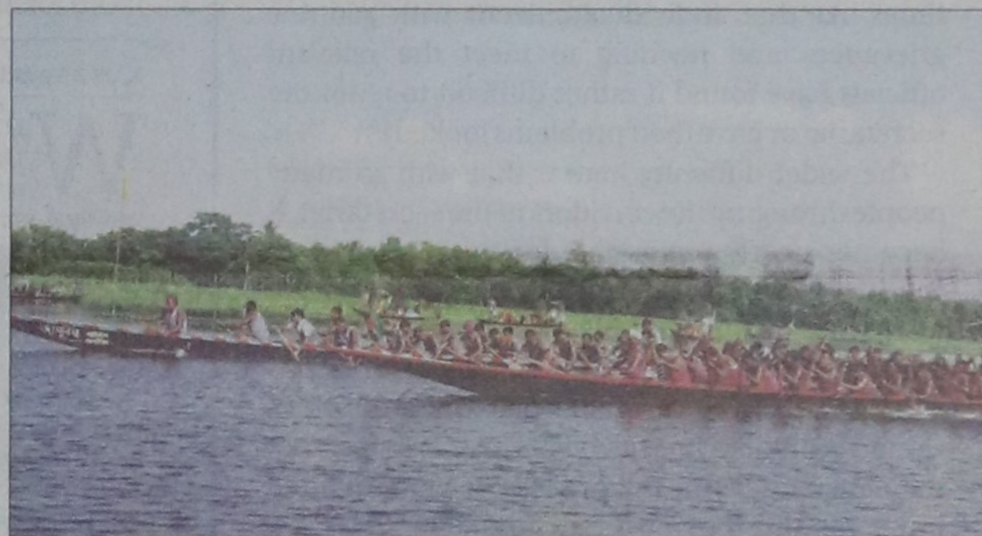
Preserving heritage: the boat race in Tangail.