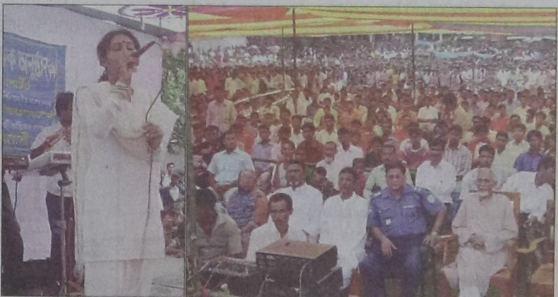
An artiste sings at the programme. Enthusiastic observers at the cultural function.