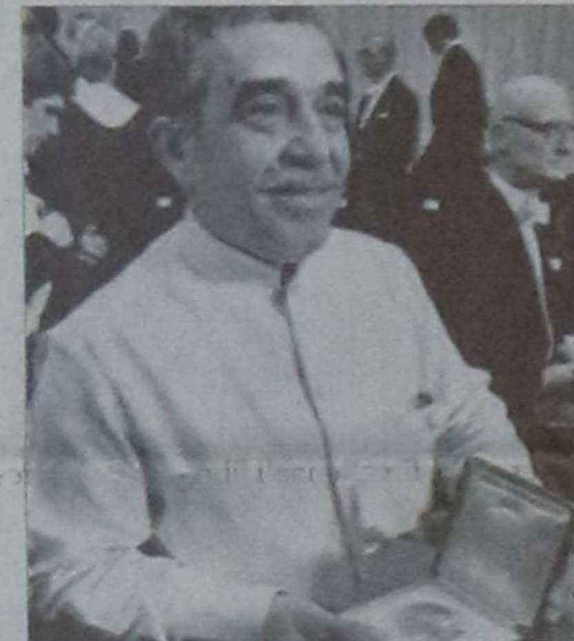
Gabriel Garcia Marquez was awarded the Nobel Prize for literature in 1982.

Marquez's novel, originally published in Spanish in 1967, tells the