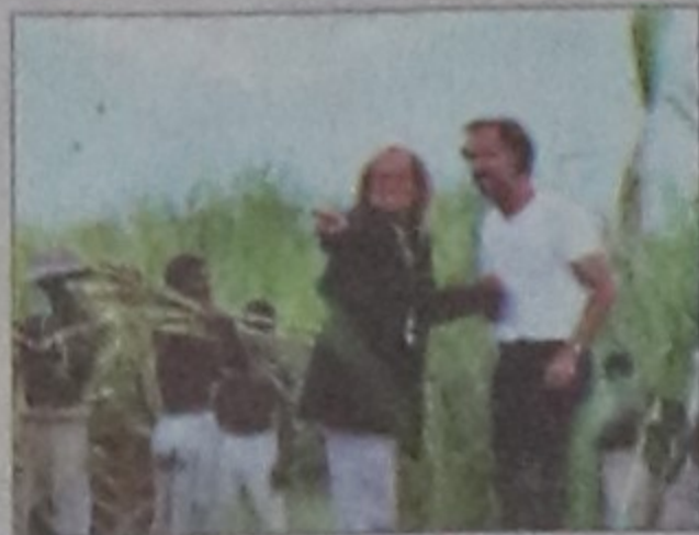
Photo Exhibition On the occasion of 60 th birth anniversary of Werner Herzog Title: Film Must be Physical Venue: Goethe-Institut Bangladesh, H 10, Rd 9, Dhanmondi Date: Sep 16-Oct 8

Solo Painting Exhibition Artist: Shahabuddin Venue: Gallery Chitrak, H 21, Rd 4, Dhanmondi Date: September 18-Oct 9 Time: 10am-1pm, 5-8pm