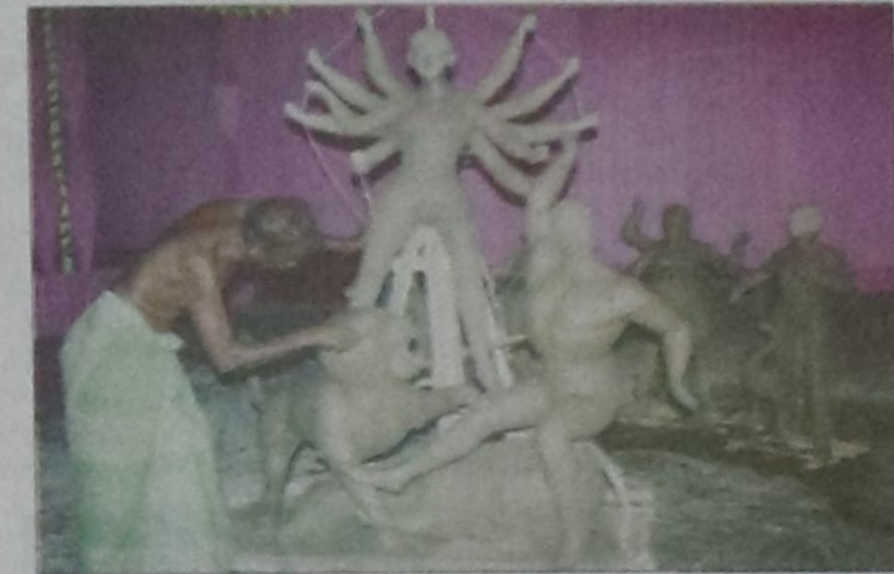
The making of the deities.