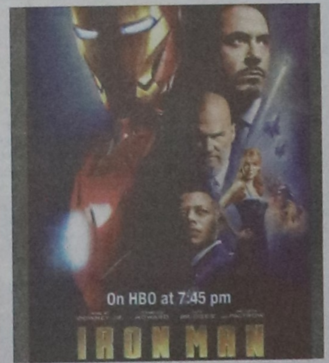
On HBO at 7:45 pm

09:00 BBC World News 09:30 HARDtalk (r) Ted Forstmann 10:00 BBC World News 10:30 Fast Track 11:00 BBC World News 11:30 India Business Report 12:00 BBC World News 12:30 Middle East Business Report (r) 01:00 BBC World News 01:30 Thinking Big (r) The American Pipe Dream 02:00 BBC World News 02:30 Dateline London (r) 03:00 BBC World News 03:10 The Day After Peace (r) 04:00 BBC World News 04:30 Talking Movies (r) 05:00 BBC World News 05:30 India Business Report (r) 06:00 BBC World News 06:30 Newsnight (r) 07:00 BBC World News 07:15 Sport Today 07:30 Our World: Shana UK (r) 08:00 BBC World News 08:30 The Real... Hong Kong 09:00 BBC World News 09:10 The Day After Peace 10:00 BBC World News Special 11:30 India Business Report