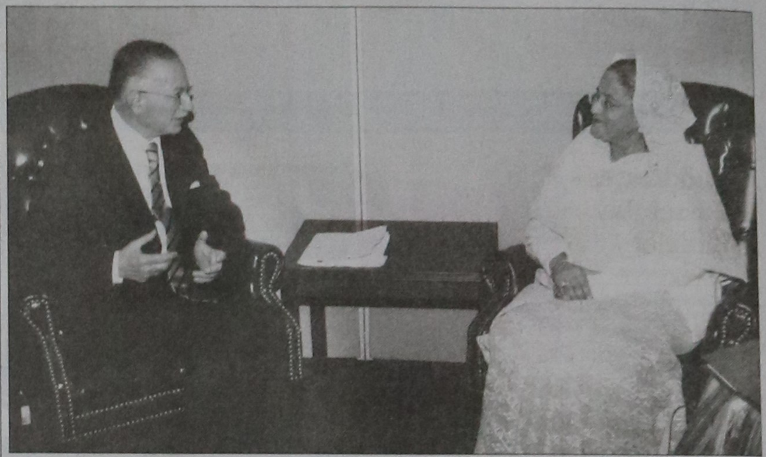
OIC Secretary General Prof Ekmeleddin Ihsanoglu calls on Prime Minister Sheikh Hasina at the United Nations Headquarters in New York on Friday.