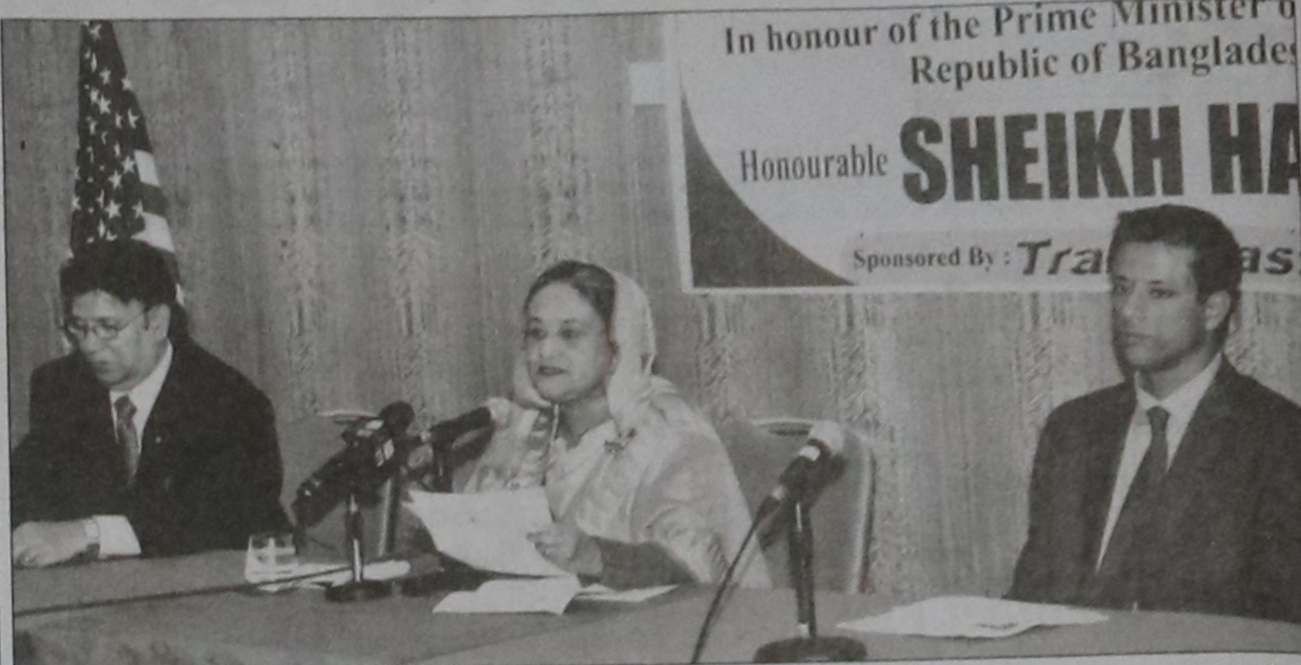
Prime Minister Sheikh Hasina speaks at a seminar on 'Why Bangladesh is an Attractive Investment Destination' at Hotel Grand Hyatt in New York on Thursday. (Story on Page 1)