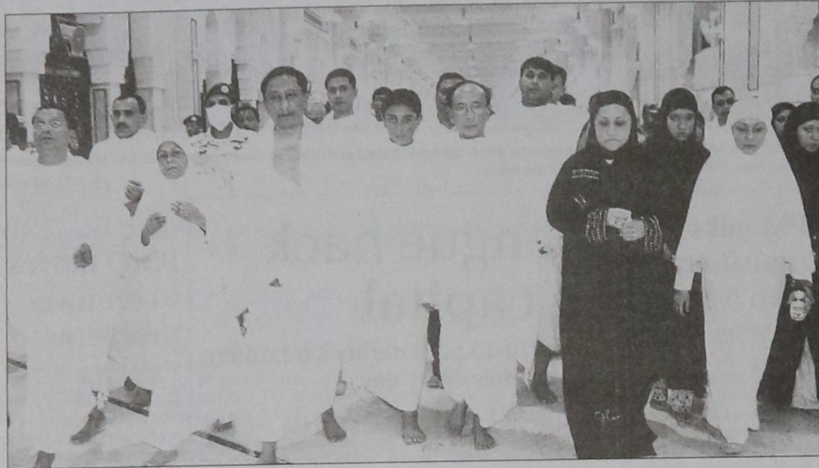
President Zillur Rahman, now on a six-day visit to Saudi Arabia, performs Umrah at the holy Kaaba in Makkah on Thursday.

Local administration and the police have been asked to investigate the incident and take legal action against the persons involved, he added.