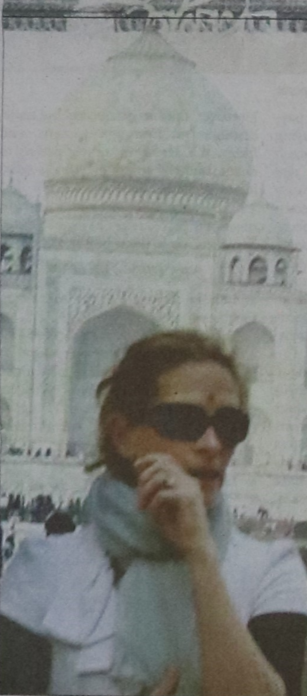
Julia Roberts visits the Taj Mahal.