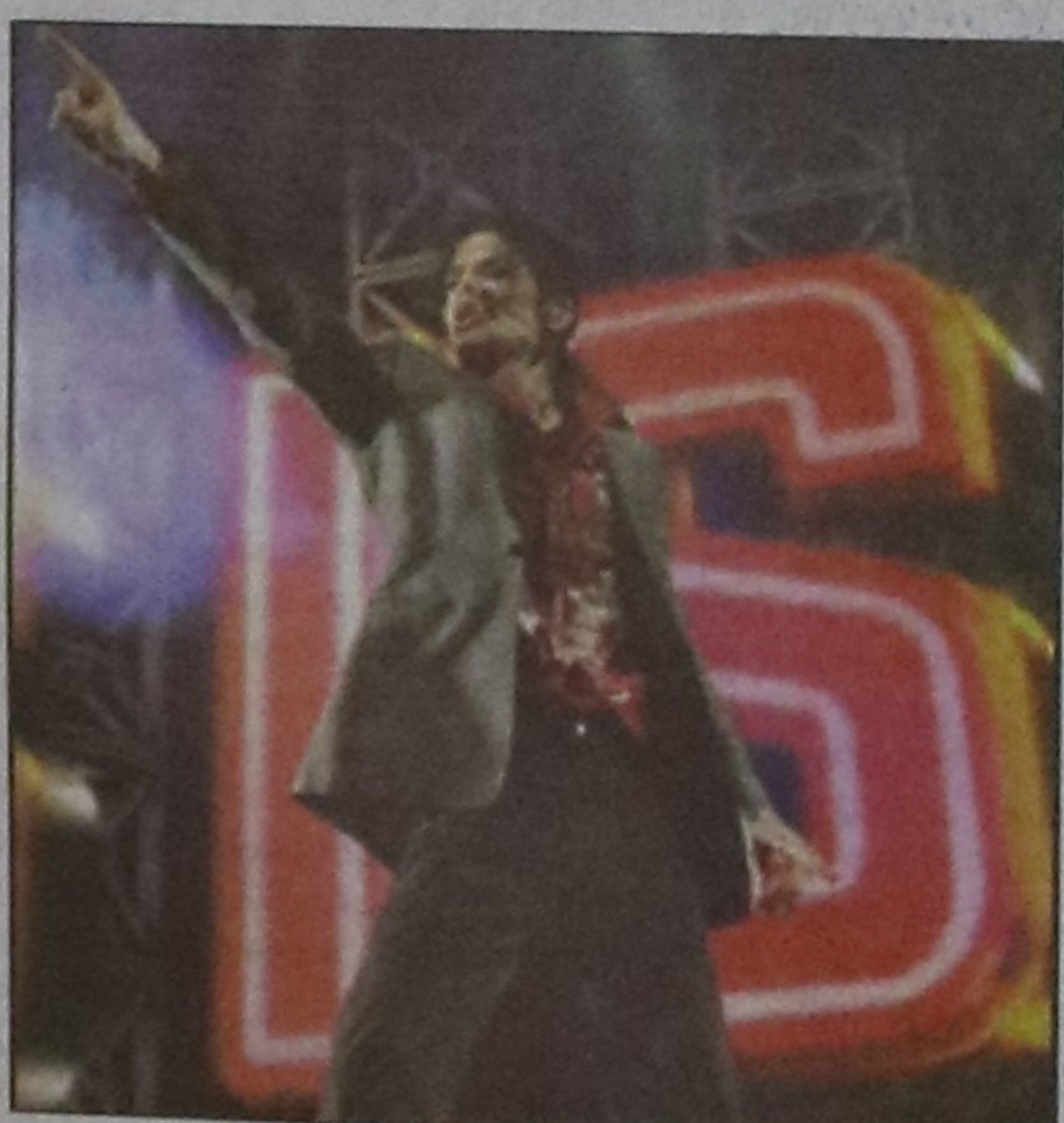
Jackson's last rehearsal was in Los Angeles two days before he died.

"Michael Jackson has an army of fans everywhere around the world... we are