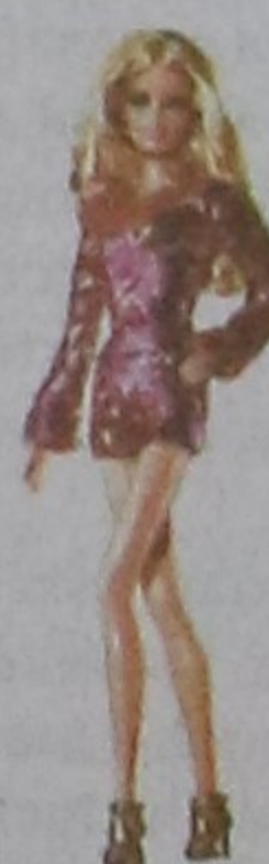
Barbie in her Heidi Klum incarnation.

Universal won the moulded plastic heart of Barbie, while Sony will own the thrill of the promotional catchphrase "By the power of Grayskull, I have the power!" as it unleashes He-