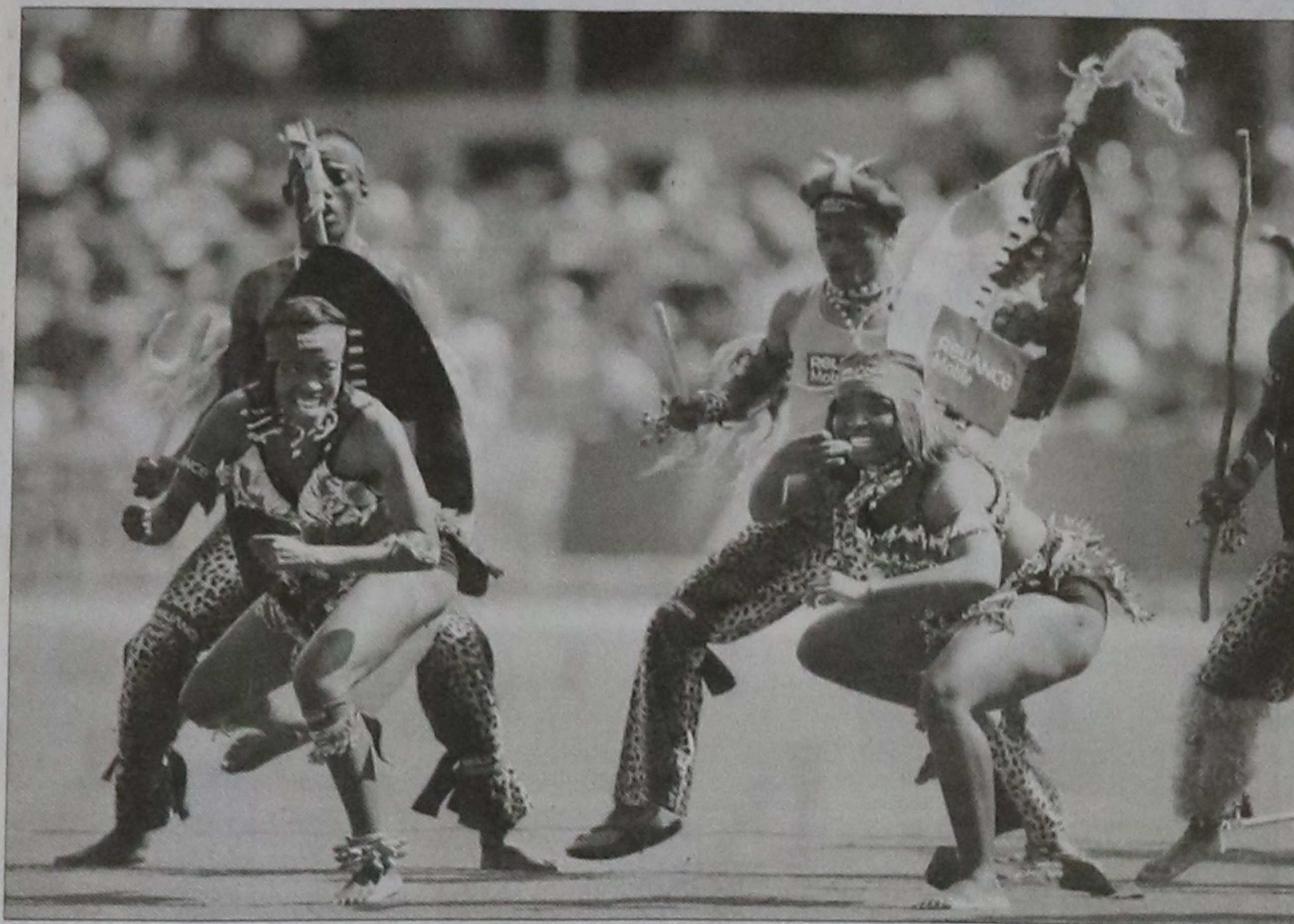
South African dancers perform a traditional dance during the opening ceremony of the Champions Trophy at SuperSport Park in Centurion on Tuesday.