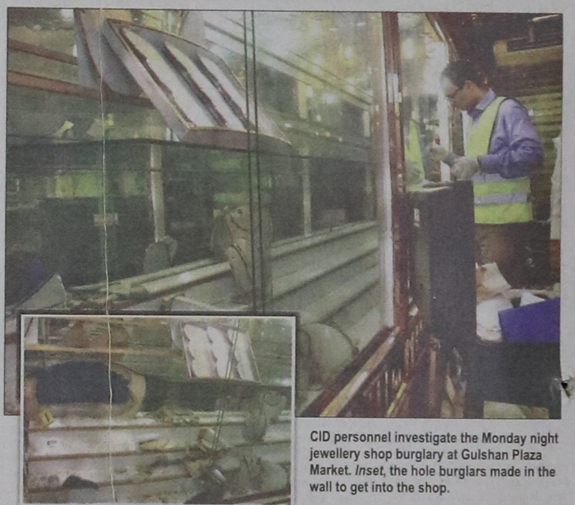
CID personnel investigate the Monday night jewellery shop burglary at Gulshan Plaza Market. Inset, the hole burglars made in the wall to get into the shop.