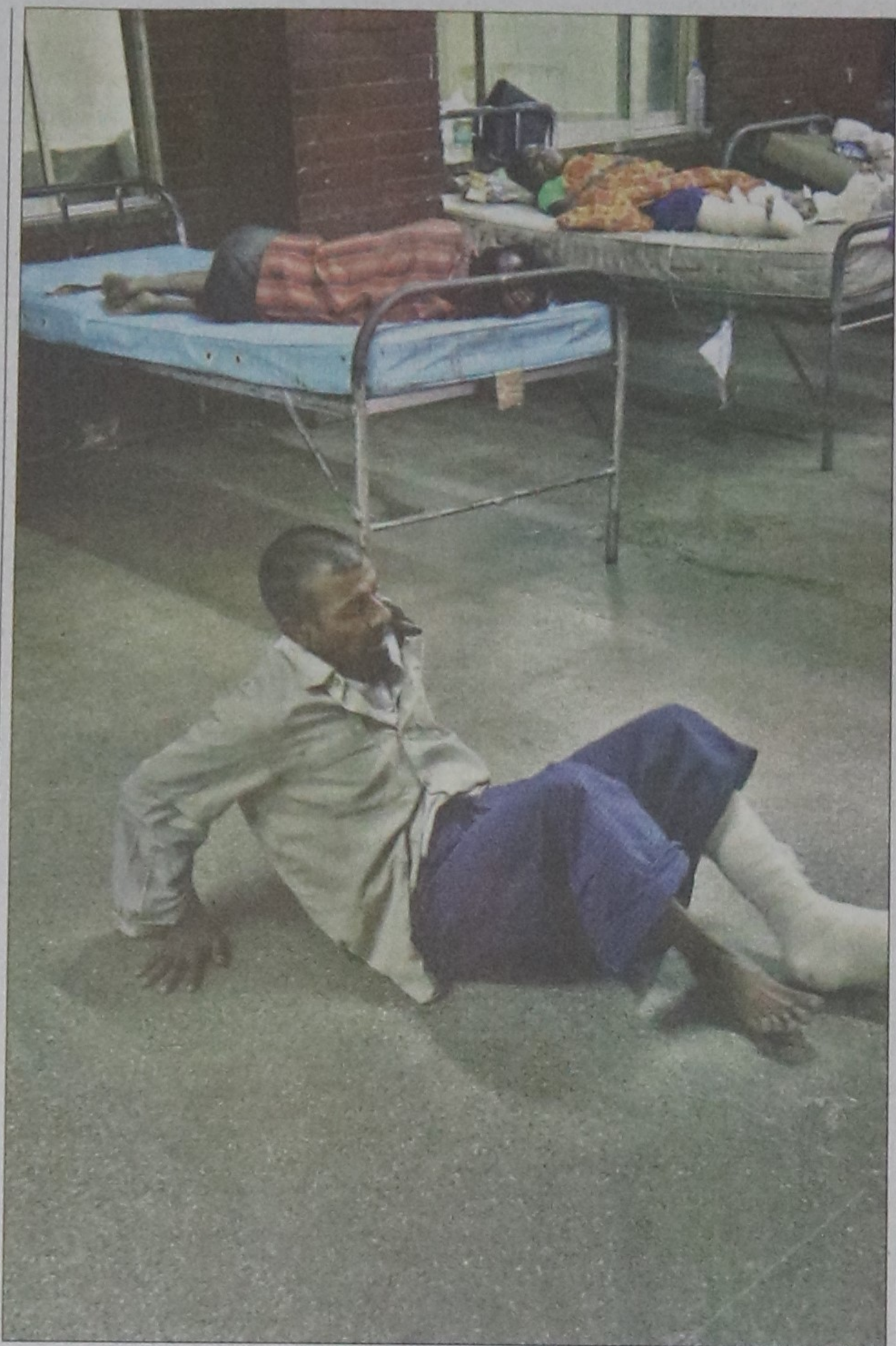
Lack of doctors and nurses at Dhaka Pongu Hospital during the Eid vacation compels this patient to move through the ward unattended adding to his misery.