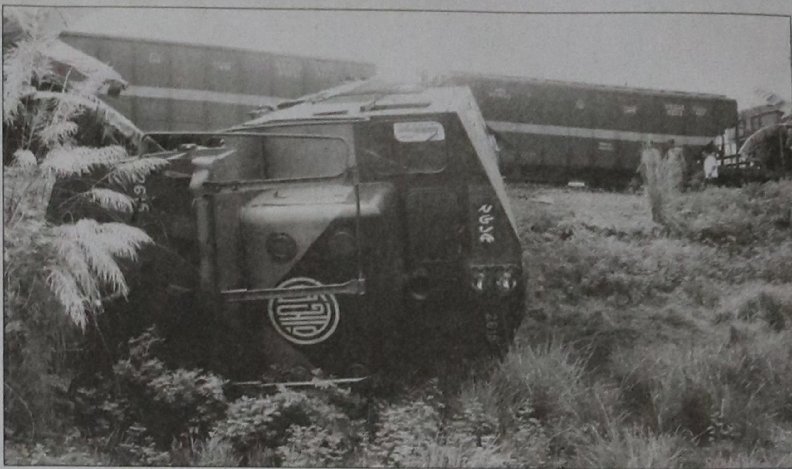
A goods train from Santahar derailed at Ishwardi station yesterday morning, disrupting movement of trains on the metre gauge line linking Dhaka for about nine hours. (Story on Page 15)

Earlier, CID arrested Harkatul-Jihad-al-Islami (Huji) leader and several other Huji members for their involvement in the bomb blasts.