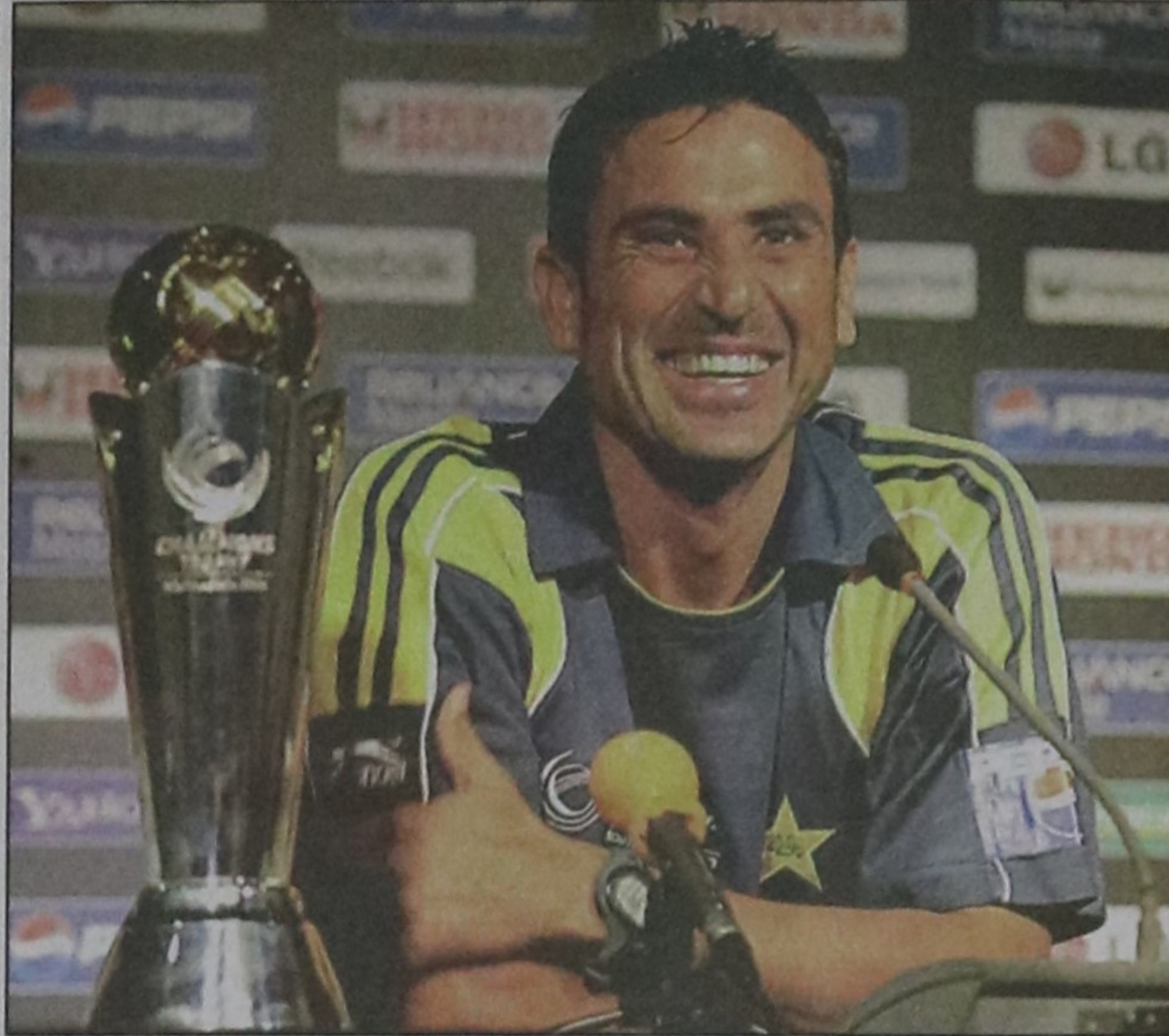
Pakistan captain Younus Khan is all smiles during a press conference in Johannesburg yesterday.

"My aim should be to get back to the team and cement my place, not just in the Twenty20 or ODI side but also in the Test team," Pathan said.