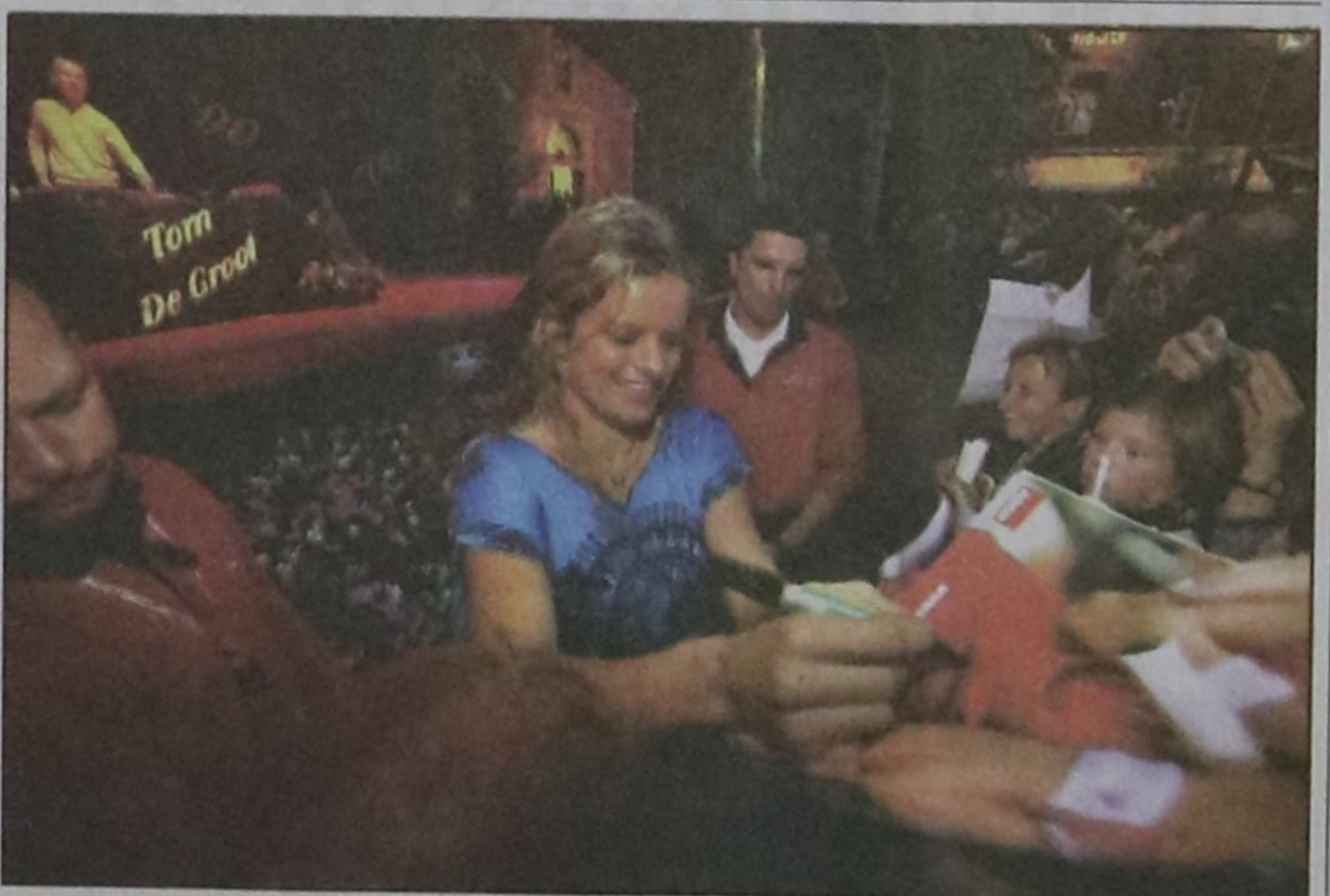
2009 US Open ladies singles champion Kim Clijsters signs autographs for her fans on her return to native Bree in Belgium on Friday.

THURSDAY ESPN German FA Cup FC Koln v VfL Wolfsburg Live from 1:25am