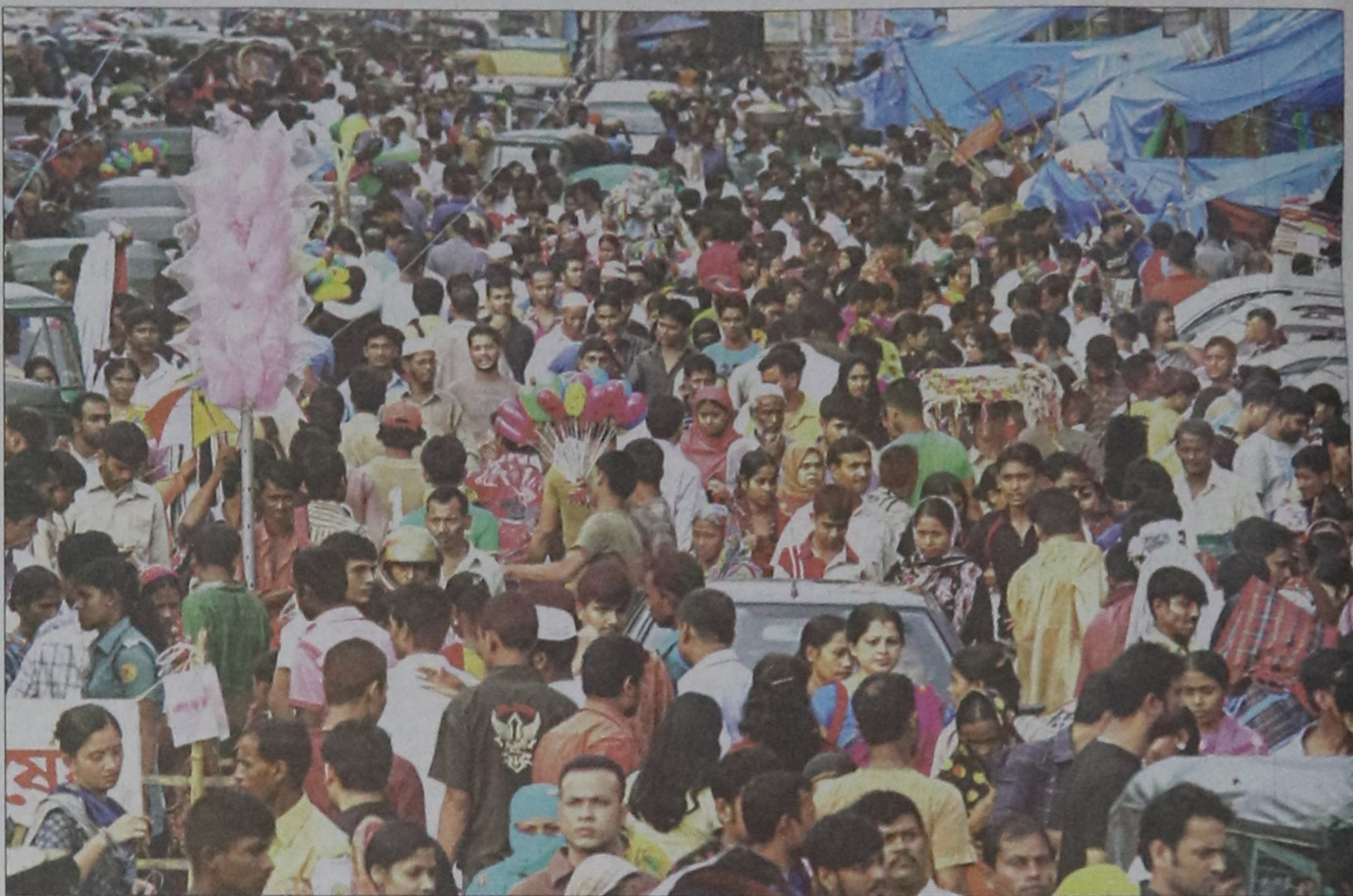
Hawke's, parked cars and shoppers crowd streets in front of malls in the capital yesterday as time for Eid shopping runs out. The photo was taken near Gausia Market. Story on page 2.